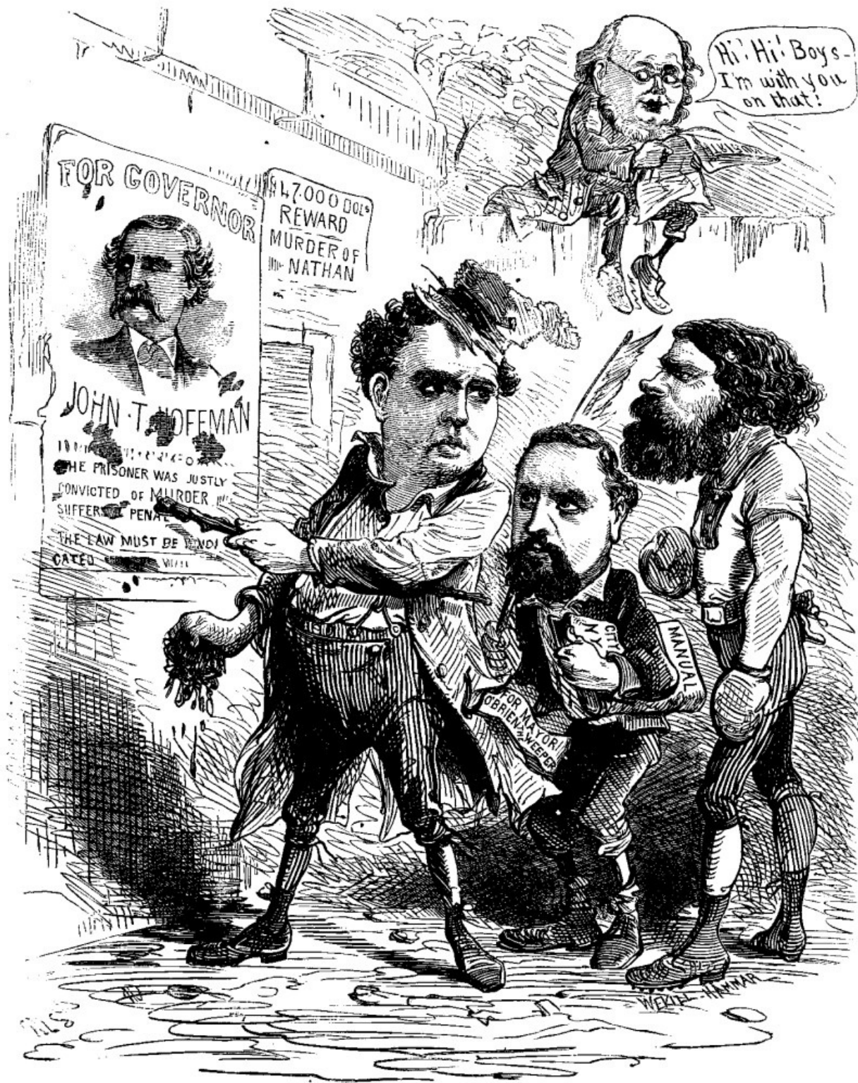
LAW VERSUS LAWLESSNESS. THE VIRTUOUS ALLIES OF THE NEW YORK "SUN" ENGAGED IN THEIR CONGENIAL OCCUPATION OF THROWING DIRT.