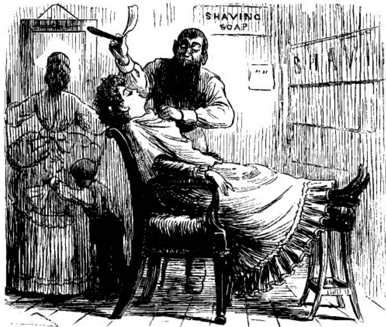
WOMAN ASSERTS HER RIGHTS