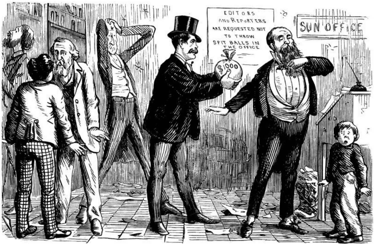
CONSTERNATION OF THE EDITORIAL STAFF OF THE NEW YORK SUN , (INCLUDING THE OFFICE BOY,) ON SEEING CHIEF EDITOR PECKSNIFF DANA DECLINING TO ACCEPT A HEAVY BRIBE OFFERED HIM TO PUBLISH A MENDACIOUS PARAGRAPH ABOUT A RESPECTABLE CONTEMPORARY.