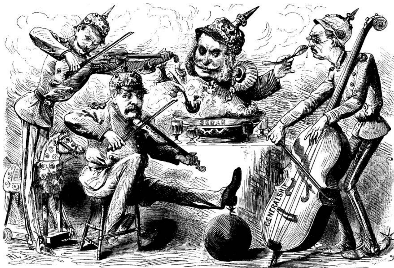
THE MODERN "OLD KING COLE."

on his system of telling the truth. Weaker critics would have let up on that manager lest it should be thought that they abused him because he refused their plays. But not so with SPIFFKINS. His moral courage was too heroic to resort to so mean a subterfuge as that, and to this day that manager believes that the reason SPIFFKINS abused him is because he refused his play! Sometimes SPIFFKINS threw a little light on subjects that were generally misunderstood. For instance, he said that NILSSON was a "charming mezzo-soprano," and declared that "RIP VAN WINKLE" was a more delightful translation from the French than had been seen for many a day. Occasionally SPIFFKINS eked out his salary by writing letters to the provincial press. In this respect he was invaluable, because his letters contained, about things in New York, information which never appeared in the New York papers; so that when a Philadelphia family takes the newspaper which SPIFFKINS corresponds with, that family is fully posted upon everything which might just as well have happened here as not. SPIFFKINS is too real a gentleman at heart to be much of one in appearance. If his boots and manners are equally unpolished, I know that his heart is in the right place—just where his pocket-book is; and if his linen is dirty and his face unshorn, I feel certain that his soul is clad in immaculate spiritual lawn, and that his better nature is shaved close.