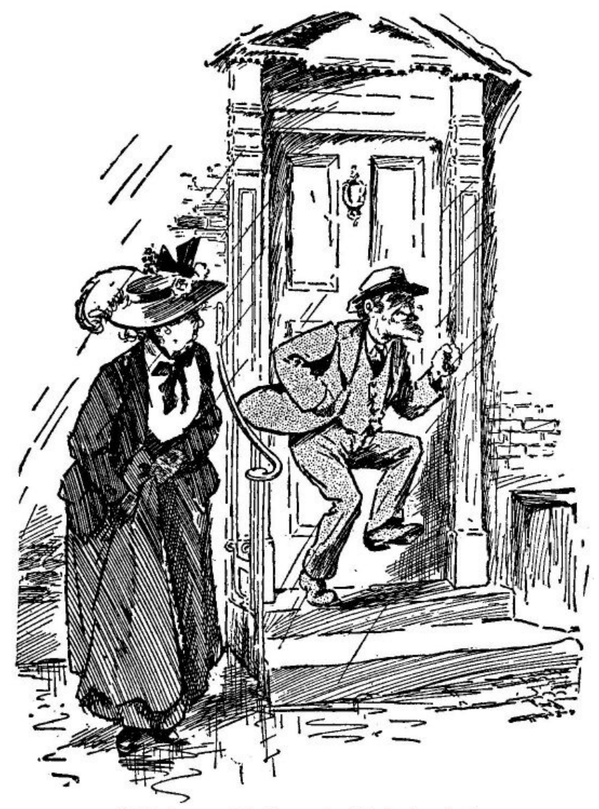
"What on earth's the matter?" she inquired

"Chill," replied Mr. Teak. "I've got wet."