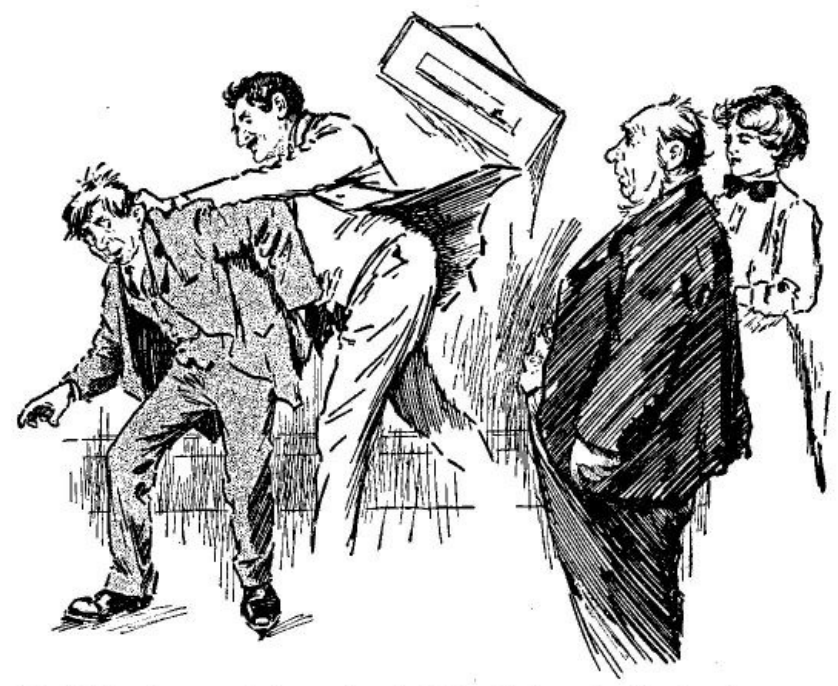
He felt the large and clumsy hand of Mr. Butler take him by the collar