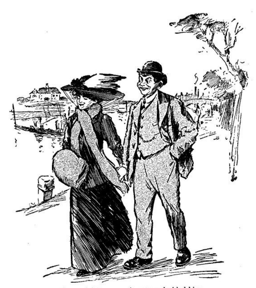
A very faint squeeze in return decided him

She turned away, and Mr. Sharp, plucking up spirit, ventured to take her hand and squeeze it. A faint, a very faint, squeeze in return decided him.