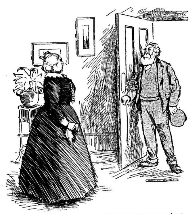
"If I take you back again," repeated his wife, "are you going to behave yourself?"

"It isn't the same voice and it isn't the same face," said the old woman; "but if I'd only got a broomhandle handy——"