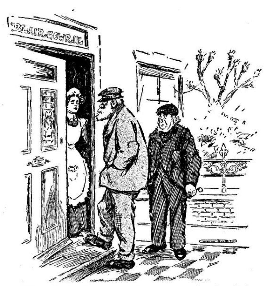
"You tell 'er that there's two gentlemen here what have brought 'er news of her husband"

"You tell 'er," said Mr. Davis, inserting his foot just in time, "you tell 'er that there's two gentlemen here what have brought 'er news of her husband, and look sharp about it."