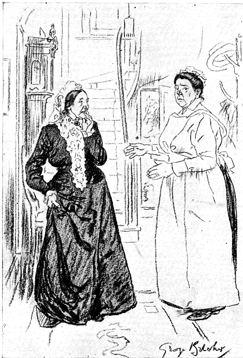
Servant (on hearing air-raid warning). "I SHALL STAND HERE IN THE MIDDLE OF THE 'ALL, MUM, SO THAT IF A BOMB COMES IN AT THE FRONT-DOOR WE CAN GO OUT AT THE BACK."