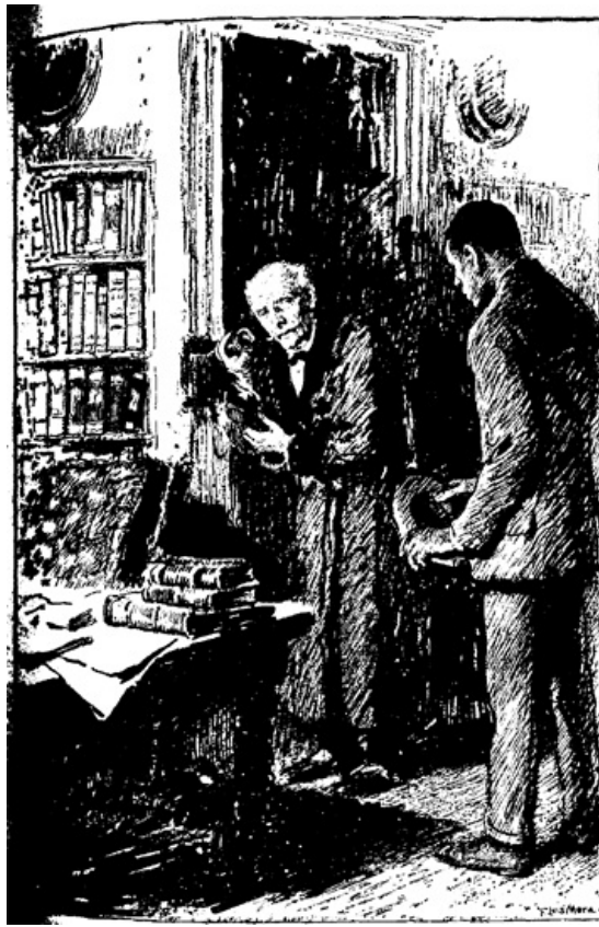
The Old Gentleman Turned Around at Last

From the darkness outside, Dr. Jallup's horn summoned the two men. Captain Renfrew got out of his gown and into his coat and turned off his gasoline light. They walked around the piazza to the front of the house. In the street the head-lights of the roadster shot divergent rays through the darkness. They went out. The old Captain took a seat in the car beside the physician, while Peter stood on the running-board. A moment later, the clutch snarled, and the machine pattered down the street. Peter clung to the standards of the auto top, peering ahead.