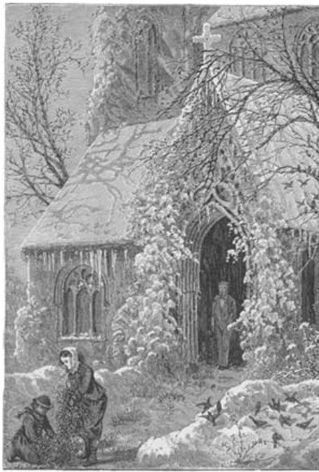
THE CHILDREN IN THE CHURCHYARD.