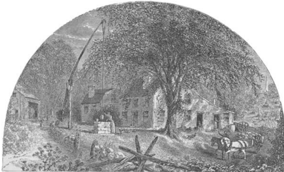
THE PITKIN HOMESTEAD.