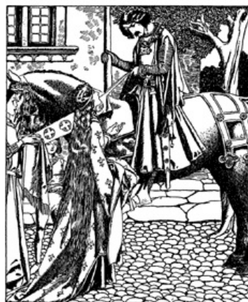
Sir Launcelot talks with King Bagdemagus.

Now when the morning had come, the folk who came to witness that tournament began to assemble from all directions--lords and ladies of high degree, esquires and damsels of lesser