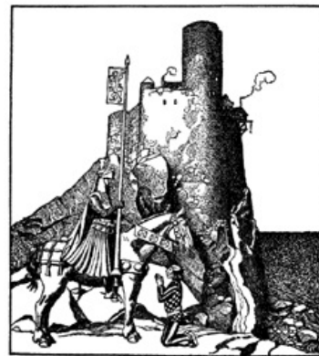
Sir Tristram meets the lady of the castle.