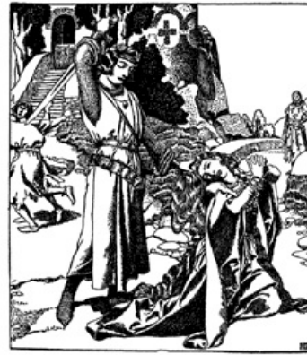
The Lady Vivien undoes her enchantment.

Now when those people who had been thus bewitched beheld the Lady Vivien, how Sir Percival held her by the hair of her head, they made great outcry against her for vengeance, saying: "Slay her! Slay her!" And therewith several made at her as though to do as they said and to slay her. But Percival waved his sword before her and said: "Not so! Not so! For this lady is my prisoner and we shall not harm her unless ye come at her through me."