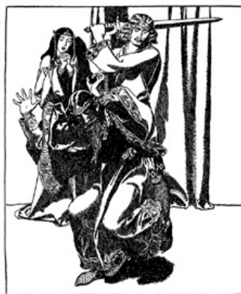
Sir Tristram departs from Tintagel.