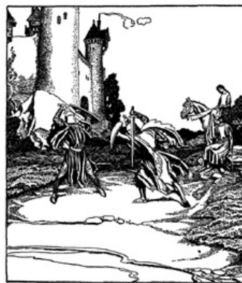
Sir Launcelot and Sir Turquine do battle together.