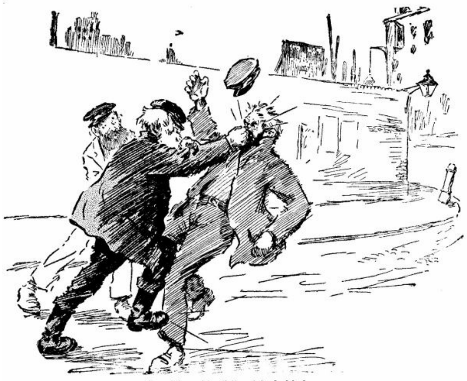
Let drive with all 'is might in his face.

For 'arf a minute Ginger didn't know where 'e was, and afore he found out the two men they'd seen in the gateway came up, and one of 'em put his knee in Ginger's back and 'eld him, while the other caught hold of his 'and and dragged the purse out of it. Arter which they both made off up the Hill as 'ard as they could go, while Peter Russet in a faint voice called "Police!" arter them.