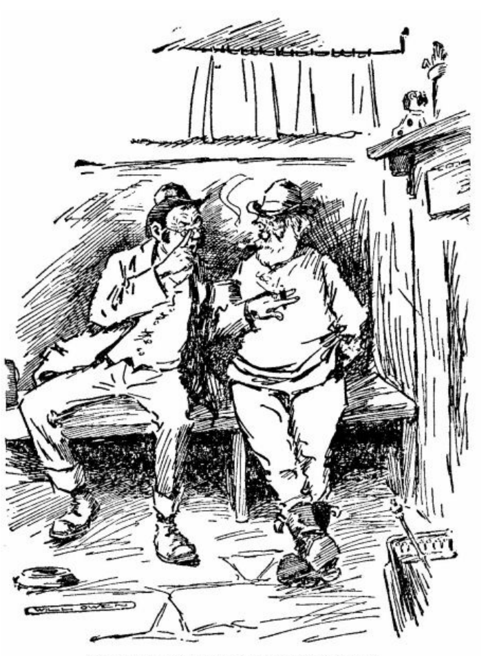
Mr. Cubbins winked at 'im and tapped 'is nose.