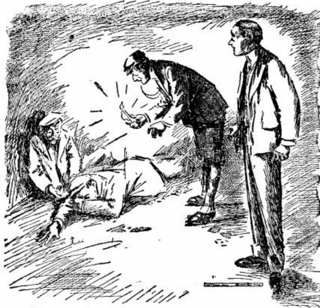
Barnes stood peering at the sleepers in silence and dropping tallow over the floor.

Barnes, who had taken the candle from the mantel-piece, stood peering at the sleepers in silence and dropping tallow over the floor.