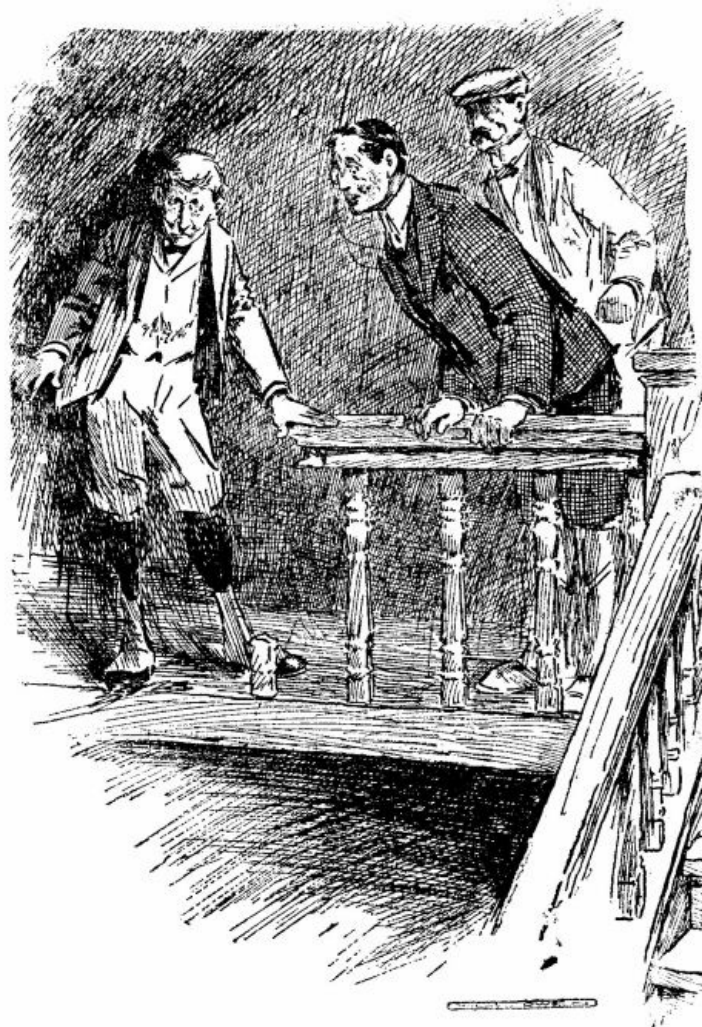
All three stood gazing at the dead man below.

He walked carelessly to the edge and looked over. In response to his startled cry the others drew near, and all three stood gazing at the dead man below.