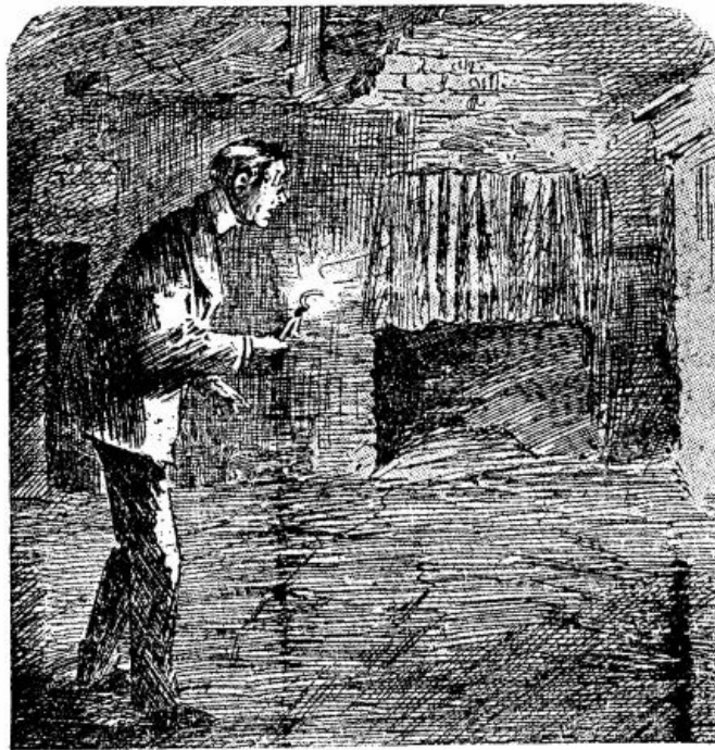
Into a vast bare kitchen with damp walls and a broken floor.

"Barnes!" he cried again. "Don't be afraid! It is I—Meagle!"