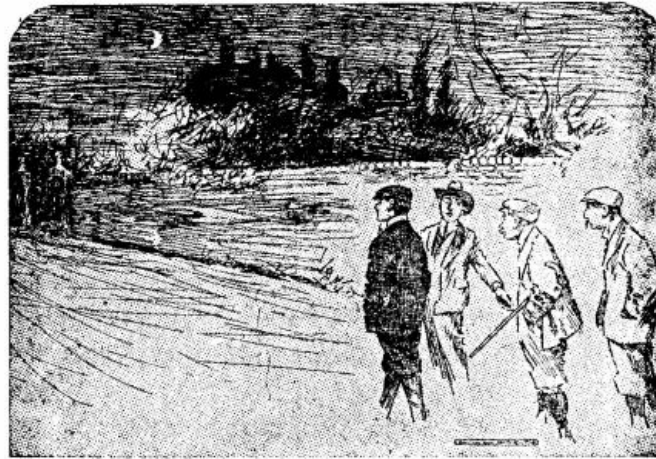
They saw the gates of the house before them

They walked on for some time in silence, broken only by White's tribute to the softness, the cleanliness, and the comfort of the bed which was receding farther and farther into the distance. Under Meagle's guidance they turned off at last to the right, and, after a walk of a quarter of a mile, saw the gates of the house before them.