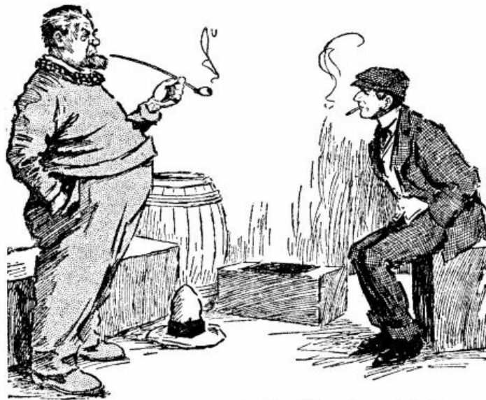
Put a bishop in my clothes, and you'd ask 'im to 'ave a 'arf-pint as soon as you would me.

Then, agin, some relations are partikler about appearances, and they don't like it if a chap don't wear a collar and tidy 'imself up. Dress is everything nowadays; put me in a top 'at and a tail-coat, with a twopenny smoke stuck in my mouth, and who would know the difference between me and a lord? Put a bishop in my clothes, and you'd ask 'im to 'ave a 'arf-pint as soon as you would me—sooner, p'r'aps.