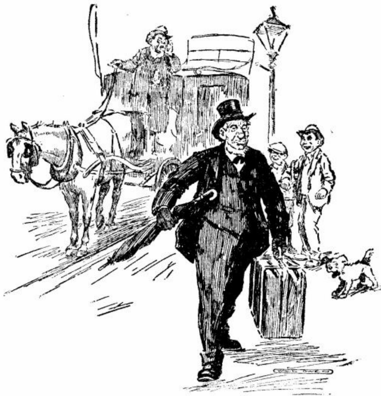
Mr. Goodman came in a four-wheel cab with a big bag and a fat umbrella

He seemed quite pleased to see Peter, and by and by Sam, who was bursting with curiosity, came down-stairs to ask Peter to lend 'im a boot-lace, and was interduced. Then Ginger came down to look for Sam, and in a few minutes they was all talking as comfortable as possible.