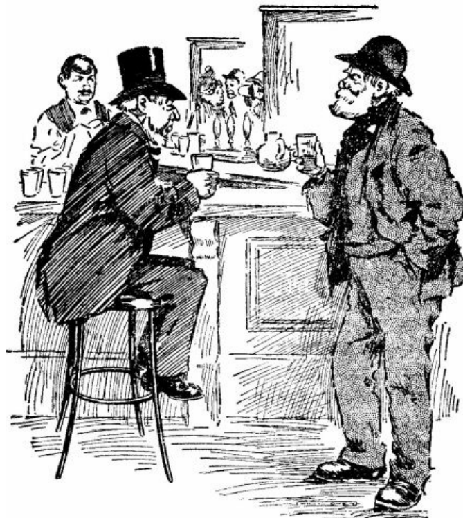
"It aint so 'orrid as I 'ad fancied," ses Sam.

"It ain't so 'orrid as I 'ad fancied," ses Sam, lap-ping up the rest very gentle.