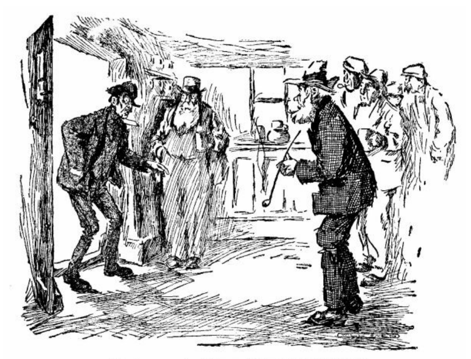
The door opened and Henery Walker came staggering in.

Five minutes arterwards the door opened and Henery Walker came staggering in. He was as white as a sheet, his 'at was knocked on one side of his 'ead, and there was two or three nasty-looking scratches on 'is cheek. He came straight to Bill Chambers's mug—wot 'ad just been filled—and emptied it, and then 'e sat down on a seat gasping for breath.