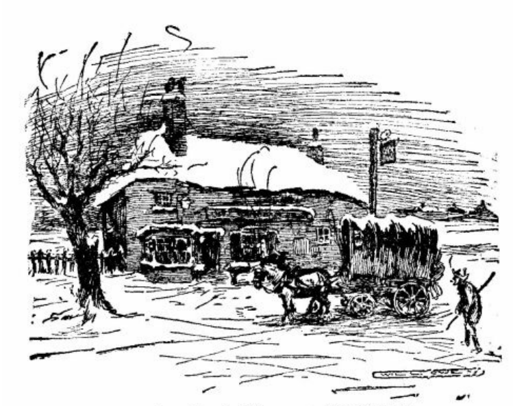
The sign of the Cauliflower was stiff with snow

The old man stood by the window, gazing at the frozen fields beyond. The sign of the Cauliflower was stiff with snow, and the breath of a pair of waiting horses in a wagon beneath ascended in clouds of steam.