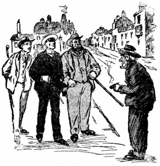
An elderly boatman, after looking at him hard, took his pipe from his mouth and bade him "Good-evening."