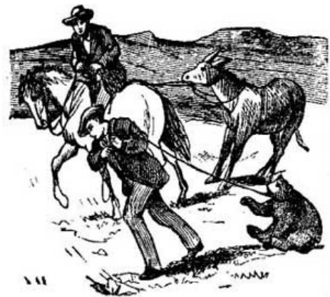
Boys and Bear.

Supper was soon dispatched, after we reached camp, the events of the day talked over, we "turned in," and in a short time were fast asleep.