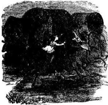
Capture of Juanita.

As soon as I could get upon my feet, I inquired for Jerry, and was told he was looking after the mules. I immediately sent for him, and he came, accompanied by Don Ignacio, who, hearing the disturbance, had come over to ascertain what it meant. When we could secure the presence of Don Ramon, we learned from him the story of the surprise.