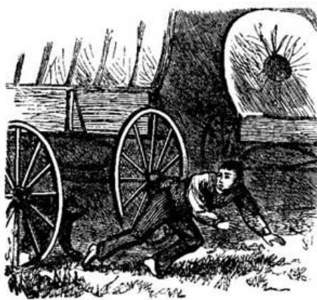
Under the Wagon

Patsey, thus awakened, had seen the creature's glaring eyes and shaggy black coat, and, not knowing in his fright what it was, concluded his Satanic Majesty had come for him, on account of his many sins and transgressions.