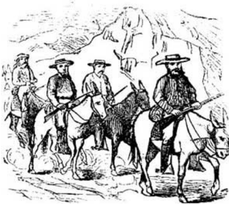
Leading the Train.

As the first rays of the rising sun flashed athwart the beautiful green prairie, the boys gave a yell of delight at the sight, which was indeed a glorious one;—the long line of wagons, each drawn by eight mules, stretching far ahead and following the tortuous windings of the road, their white covers, blue bodies, and bright red wheels presenting a contrast to the sober green of the surrounding country that was at once pleasing and unique.