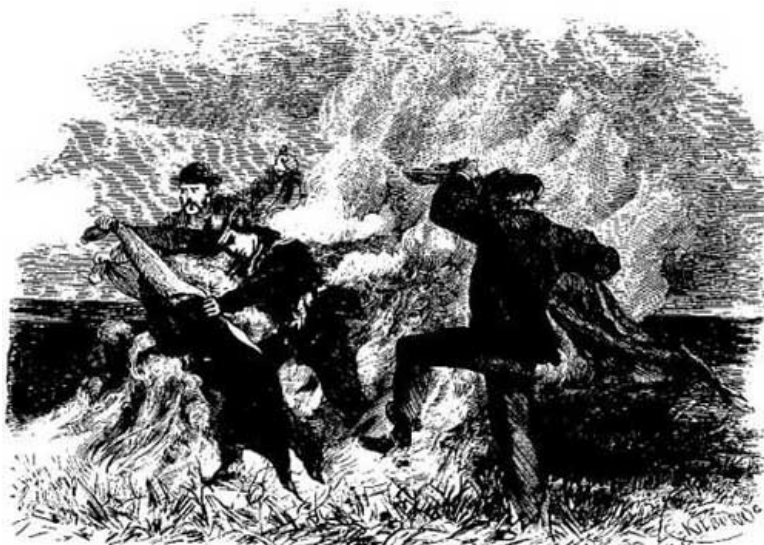
PRAIRIE ON FIRE.

THE VERITABLE ADVENTURES OF HAL HYDE AND NED BROWN, ON THEIR JOURNEY ACROSS THE GREAT PLAINS OF THE SOUTH- WEST.