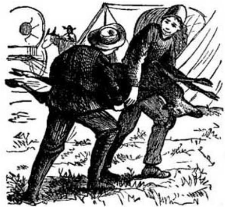
Antelope, Patsey and Ned.

I could fully understand Ned's feeling of pride, as the men, one after another, examined the game, and complimented him on his success; for Ned was a great favorite in the camp; but, when old Jerry graciously told him that he was more'n twice as old afore he killed an antelope, the boy's eyes fairly danced with joy.