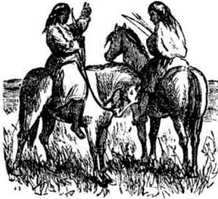
The Two Apaches.

"We'll hev ter give it to 'em, though we must be mighty keerful," continued he, "'cause it's next to sartin, thet therain't no two on 'em out there alone. We'll find thet out for ourselves, though, afore we're many hours older. Keep your eyes wide open, and your finger on the trigger o' yer rifle, and we'll go and see what they want."