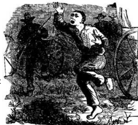
Patsey and the Snake.

"Mather!" roared Patsey. "Mather enuff, God knows! Shnakes is the mather!" making a desperate dive down into the leg of his pants. "I'm bited to death wid a shnake, so I am. Can't yez all sae I'm a did mon?"