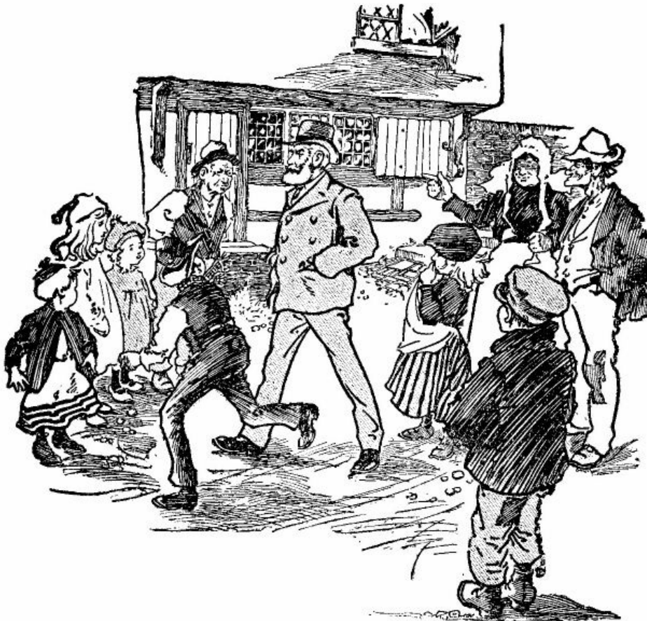
"He met these annoyances with a set face."

A weaker man would have made a detour, but he held a direct course, and with a curt nod to acquaintances who would have stopped him walked swiftly in the direction of home. Tradesmen ran to their shop-doors to see him, and smoking amphibians lounging at street corners broke out into sunny smiles as he passed. He met these annoyances with a set face and a cold eye, but his views concerning children were not improved by the crowd of small creatures which fluttered along the road ahead of him and, hopeful of developments, clustered round the gate as he passed in.