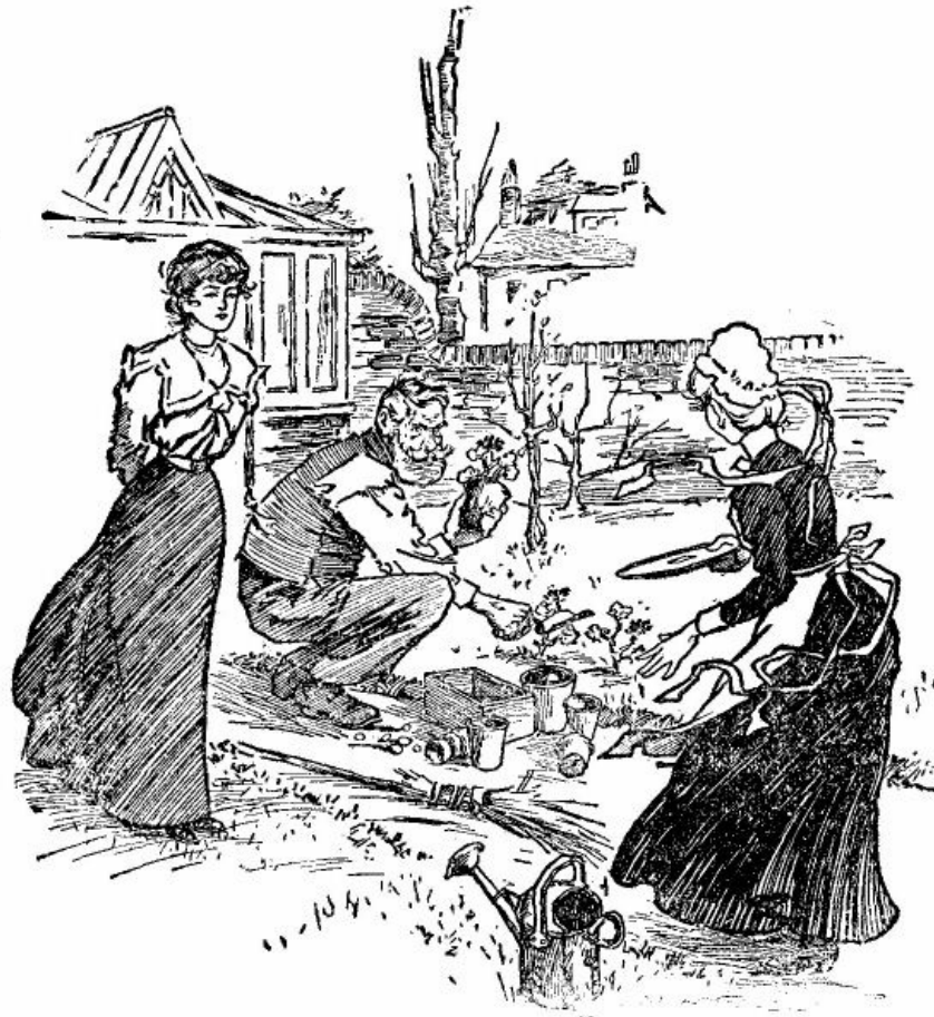
“Bella, in a state of fearsome glee, came down the garden to tell the captain of his visitor.”

had barely reached him when Bella, in a state of fearsome glee, came down the garden to tell the captain of his visitor.