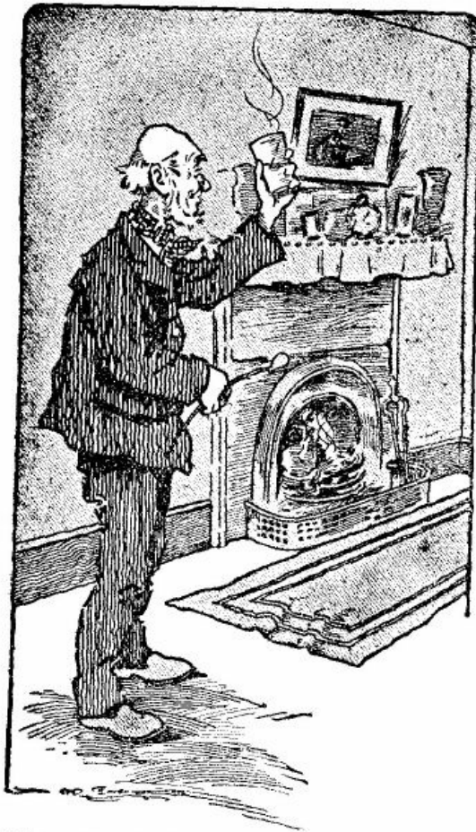
“Mr. Wilks drank to the health of both of them.”

The wind had abated somewhat in violence as they walked home, and, moreover, they had their backs to it. The walk was slower and more enjoyable in many respects than the walk out. In an unusually soft mood she replied to his remarks and stole little critical glances up at him. When they reached the house she stood a little while at the gate gazing at the starry sky and listening to the crash of the sea on the beach.