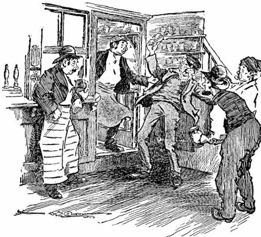
"He took a glass from the counter and smashed it on the floor."

Mr. Wilks shook the hand off and eyed his adviser ferociously. Then he took a glass from the counter and smashed it on the floor. The next moment the bar was in a ferment, and the landlord, gripping Mr. Wilks round the middle, skilfully piloted him to the door and thrust him into the road.