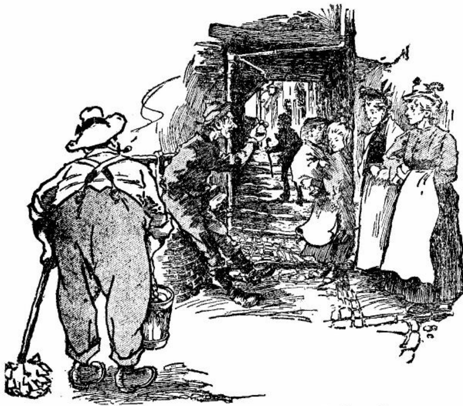
“ He said that a bit o’ wedding-cake ’ad blowed in his eye.”

"They'll soon get tired of it," said Hardy.