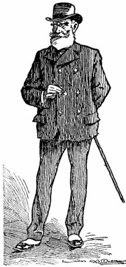
“ Captain Nugent.”

He fared no better in Fullalove Alley, a visit to Mr. Wilks eliciting the fact that that delectable thoroughfare had been put out of bounds for Miss Nugent. Moreover, Mr. Wilks was full of his own troubles and anxious for any comfort and advice that could be given to him. All the alley knew that Mrs. Silk had quarrelled with her son over the steward, and, without knowing the facts, spoke their mind with painful freedom concerning them.