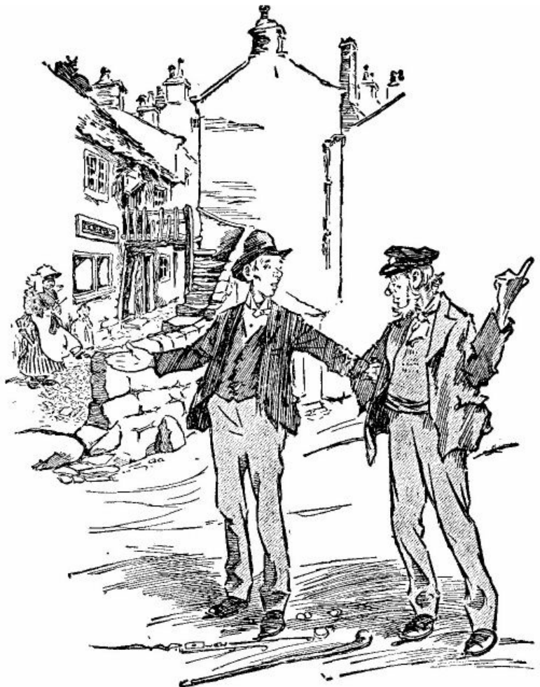
"The great thing was to get Teddy Silk home."

The steward waived the question; he knew from experience the futility of arguing with men in drink. The great thing was to get Teddy Silk home, not to argue with him. He smiled good-temperedly to himself, and with a sudden movement pinned him up against the wall in time to arrest another fall.