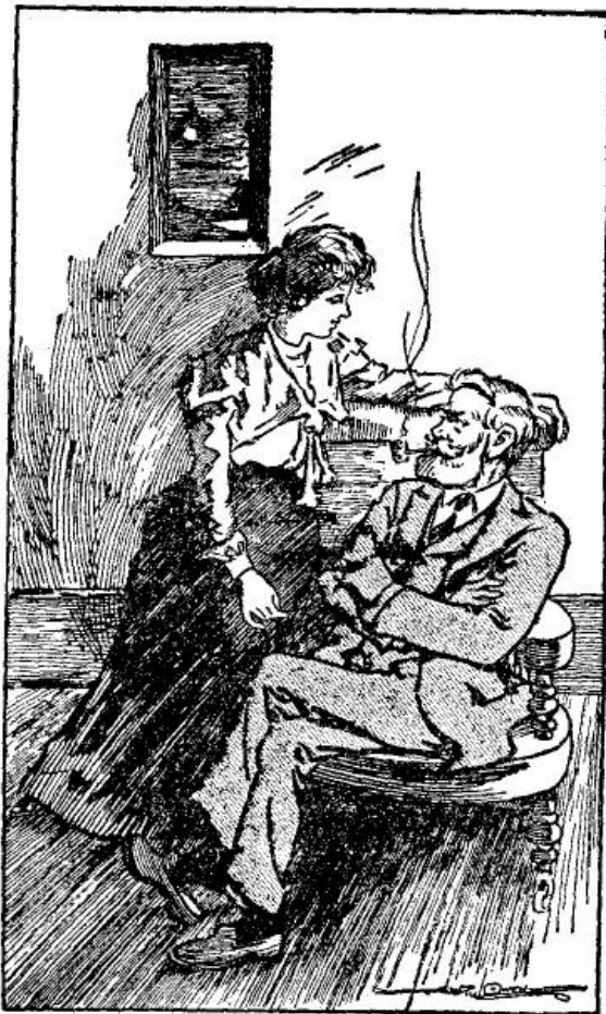
“I do hope he has not come to take you away from me.”

The indignant captain edged her off the side of his chair; Miss Nugent, quite undisturbed, got on again and sat tapping the floor with her foot. Her arm stole round his neck and she laid her cheek against his head and smiled wickedly.