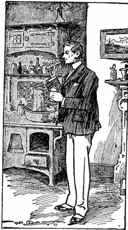
“Sniffing at their contents.”

"Two tablespoonfuls three times a day," he read, slowly. "When did you have the last, Swann? Shall I ring for the nurse?"