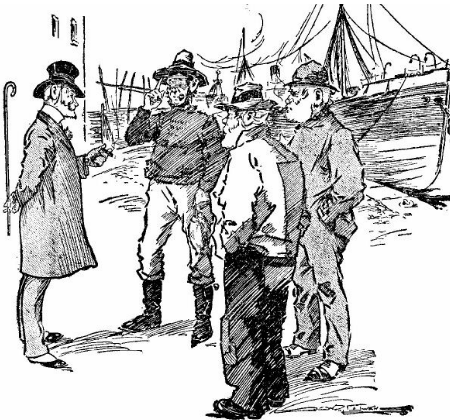
“ Pausing occasionally to answer anxious inquiries.”

"I should like to raise everybody's wages," said the benevolent Mr. Swann, as he seated himself at his desk. "Everything is like a holiday to me after being cooped up in that bedroom; but the rest has done me a lot of good, so Blaikie says. And now what is going to happen to you?"