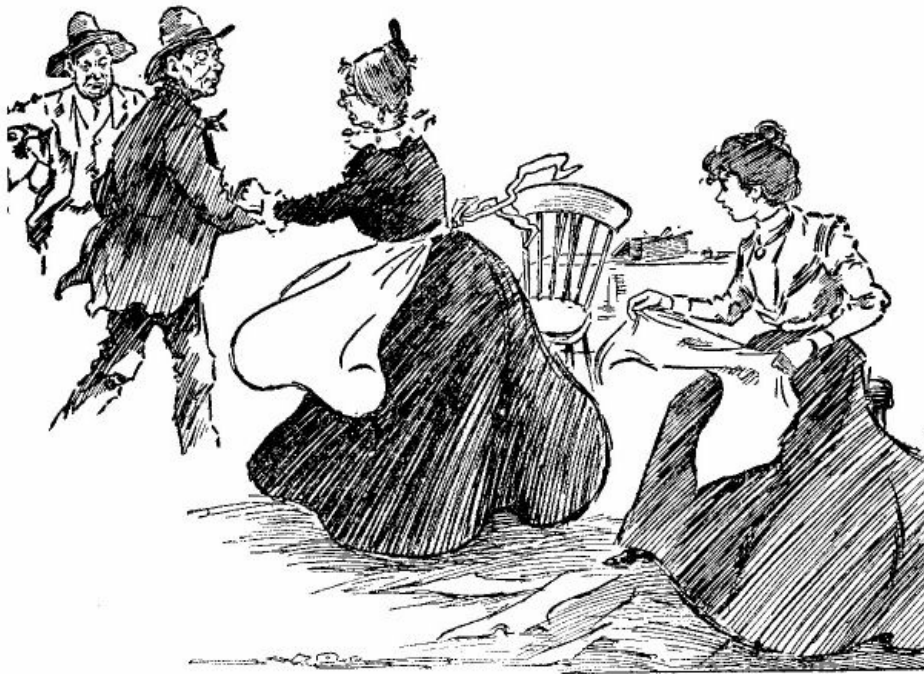
“ Mrs. Kybird suddenly seized him by the coat.”

"Don't be in a 'urry, Nat," she pleaded. "We ain't all as clever as you are."