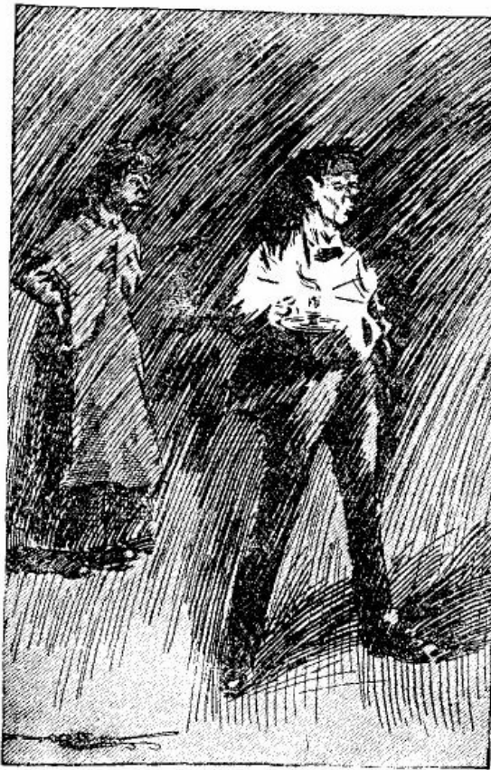
“He took up his candle and went off whistling.”