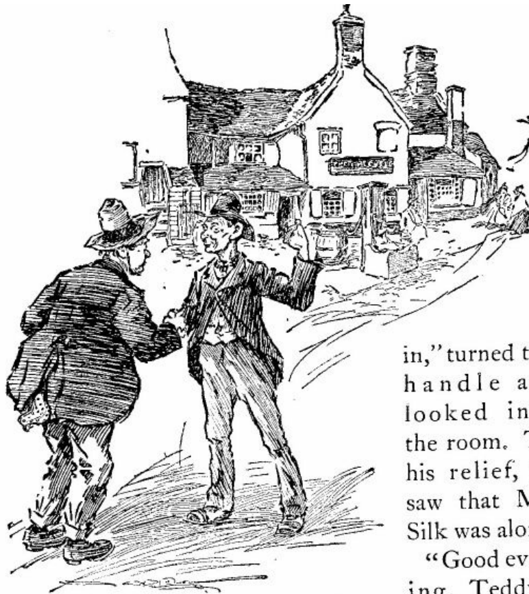
"Mr. Kybird and his old friend parted."

The summer evening was well advanced when Mr. Kybird and his old friend parted. The former gentleman was in almost a sentimental mood, and the boarding-master, satisfied that his pupil was in a particularly appropriate frame of mind for the object of his visit, renewed his instructions about binding Mr. Silk to secrecy, and departed on business of his own.