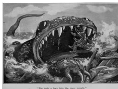
"He took a leap into the open mouth."

"This was indeed good news. Then he explained to them the plan he had in his mind, and said that it was necessary for them to kick up a rumpus in the interior of this monster, that they would thus make him so very sick that he would have to go near to land, and when they should have him there he thought he had another plan that would enable them all to escape.