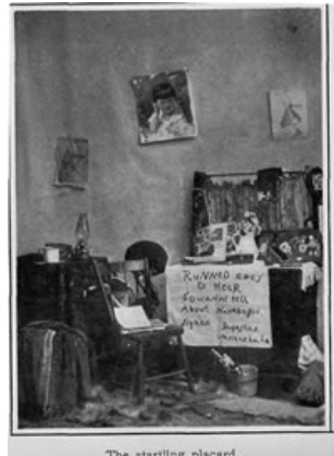
The startling placard.

One day she took them out in a graceful birch canoe among the picturesque islands. They landed on one of these islands, and spent some time in exploring its beauties and resting where grew a profusion of the fragrant Indian grass. They were for a time much interested in the various wild birds that then were so numerous and fearless. Beautiful gulls of different varieties were there nesting, and by following Mary's directions the children were delighted to find that they could approach very near to the nests of some of them without disturbing the mother bird while her mate, in fearless confidence, stood on guard beside her.