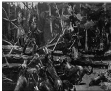
'Surrounding them were several fierce, wolfish Indian dogs.'

Trembling with anxiety, the anxious father, thankful at the narrow escape of his children, as he clasped them in his arms could not but be amazed at the indifference of the little ones to the great danger from which they had just escaped. After petting Jack and Cuffy for their great bravery and courage the return journey was begun, much to the regret of the children, who pleaded hard to be allowed to resume their trip to the wigwam of Souwanas to hear the stories of Nanahboozhoo.