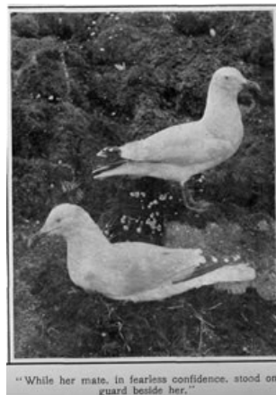
"While her mate, in fearless confidence, stood on guard beside her."

"Now, Mary, hurrah for a story!" cried the children, as they sat at lunch.