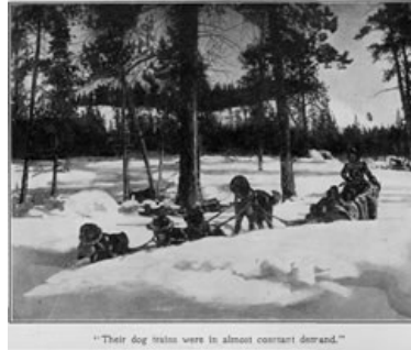
"Their dog teams were in almost constant demand."

Then what a jolly romp they had with Jack and Cuffy! The two splendid dogs were the children's special protectors and companions.