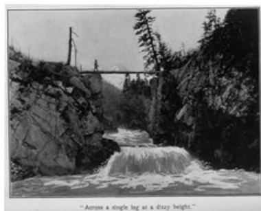
"Across a single log at a dizzy height."

Souwanas only laughed at this criticism, and proceeded with his story.