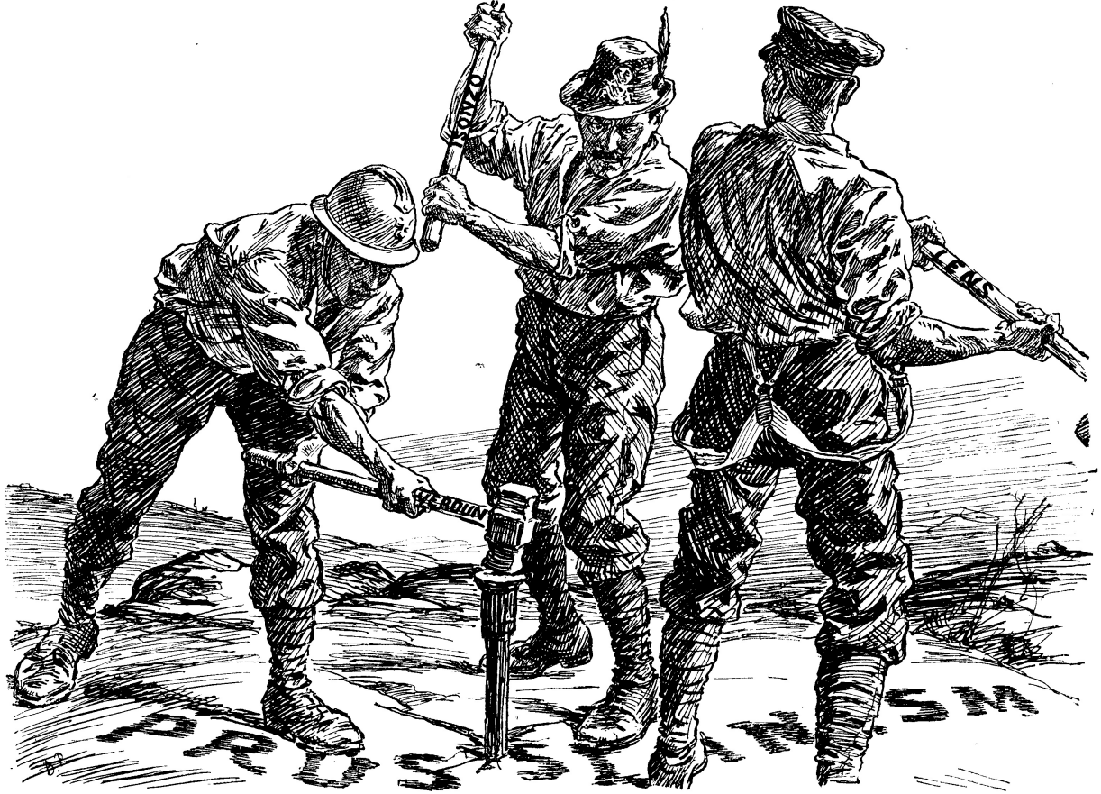
BREAKING IT UP.