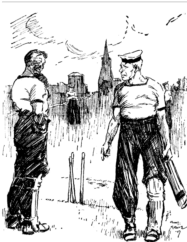
Jack (who has been bowled by a ball which kept very low): "BLOOMIN' U-BOAT TACTICS!"

The First Lieutenant smiled on him with the mature wisdom of twenty-seven summers. "Quite right, my lad. By the way, you might look in at the bath-room on the way to your cabin and tell the Junior Watchkeeper that we shan't want the bath that he is filling from the cold tap. I'm very glad we shan't."