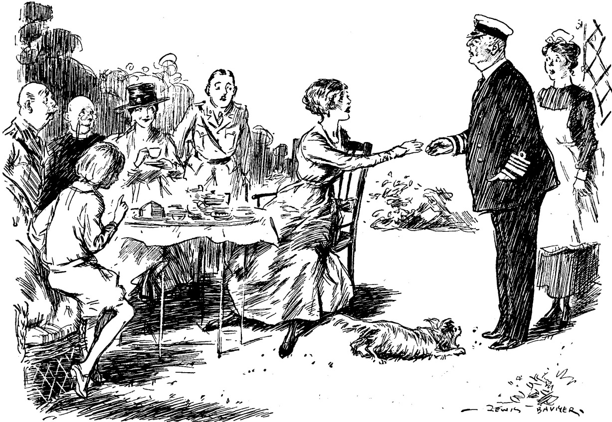
Little Girl (as distinguished admiral enters). "BE QUIET, FIDO, YOU SILLY DOG—THAT'S NOT THE POSTMAN."