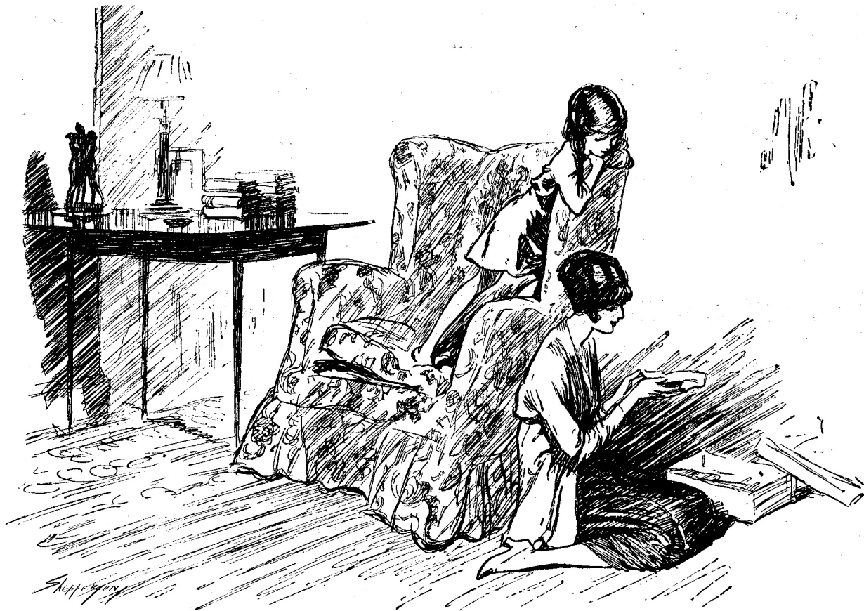
Mabel (on seeing some shoes of war-time quality newly-arrived on approval). "MUMMIE, ARE THEY REAL CARDBOARD?"