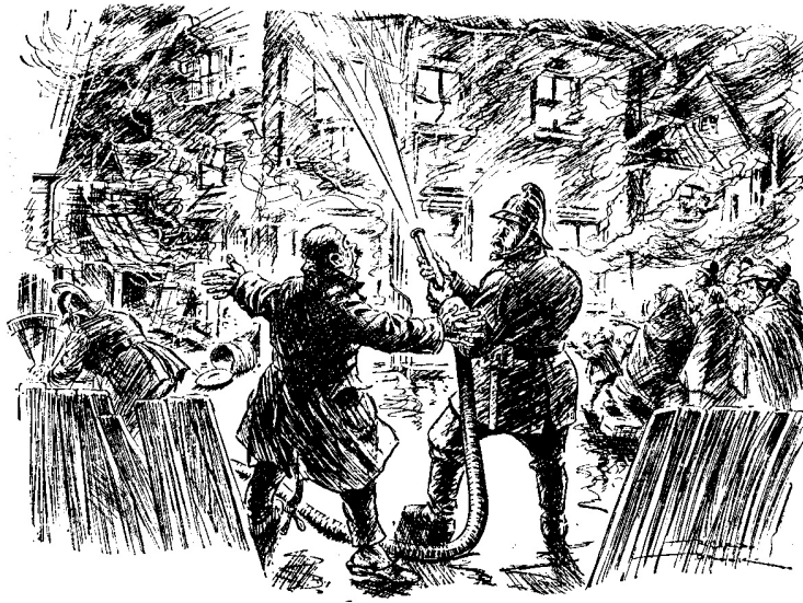
Desperate Tenant. "CONCENTRATE ON THE COAL-SHED, GUV'NOR."