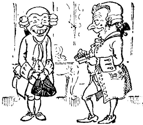
IN THE GEORGIAN ERA IT REMAINED UNDIMMED.