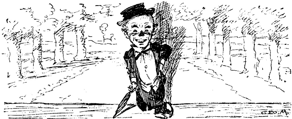
AND ONLY LAST WEEK IT WAS THE HIT OF ALL THE NEWEST REVUES.