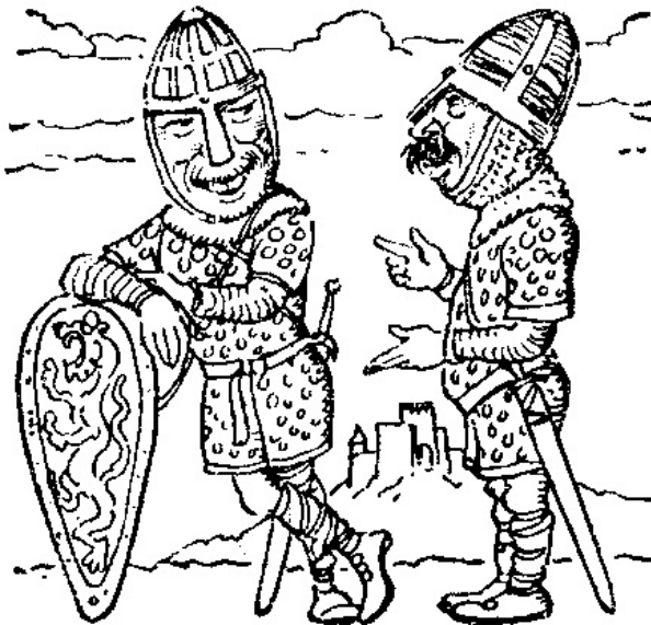
THE NORMANS KNEW IT WELL.