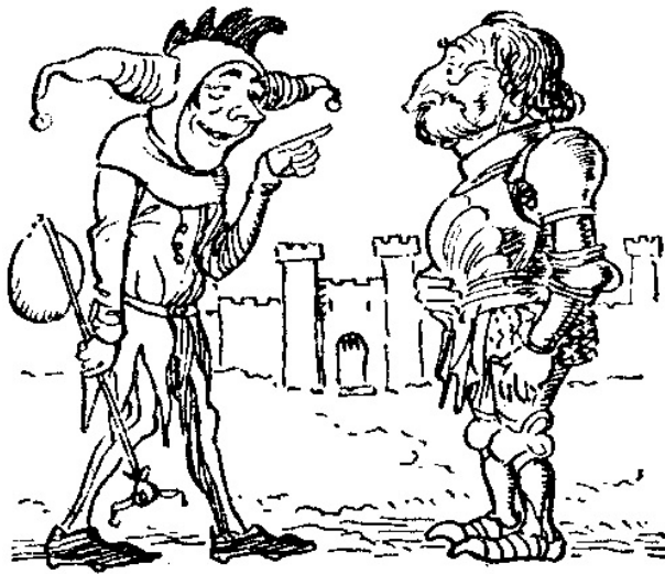
IT NEVER LOST ITS FRESHNESS THROUGH THE MIDDLE AGES.