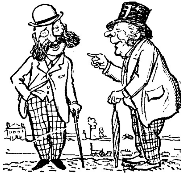
IT WAS POPULAR IN THE SIXTIES.