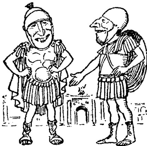
THE ROMANS REVELLED IN IT.