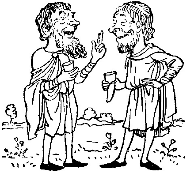
IT WAS RELISHED BY THE SAXONS.