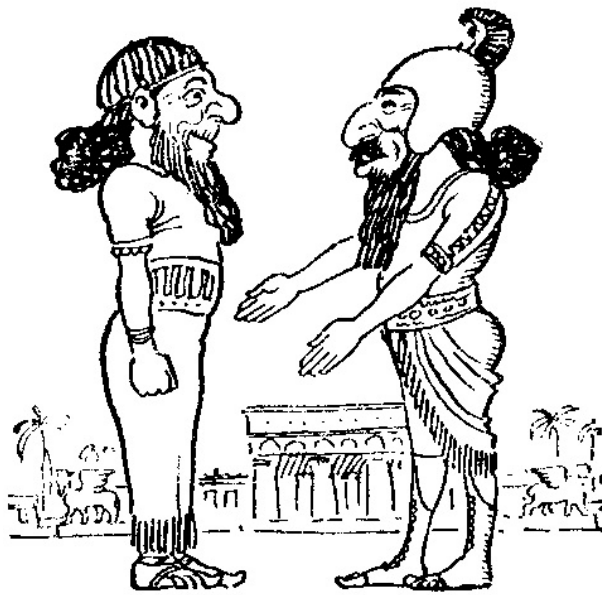
THE ASSYRIANS NEVER GREW TIRED OF IT.