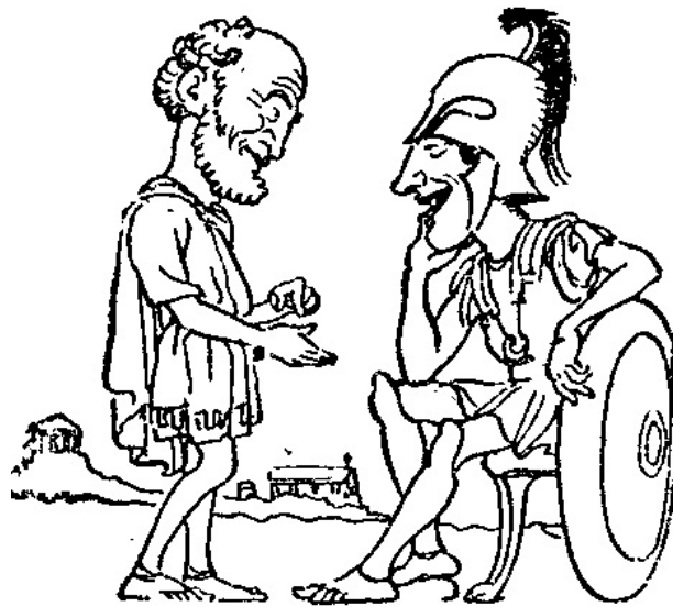
THE GREEKS GRINNED AT IT.