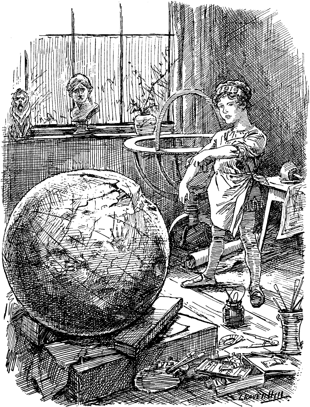
RECONSTRUCTION; A NEW YEAR'S TASK.