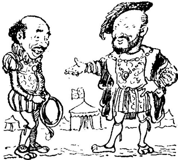
HENRY VIII. MADE HIS REPUTATION BY IT.