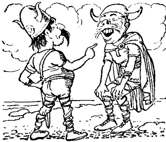
HENGIST OFTEN TOLD IT TO HORSA.