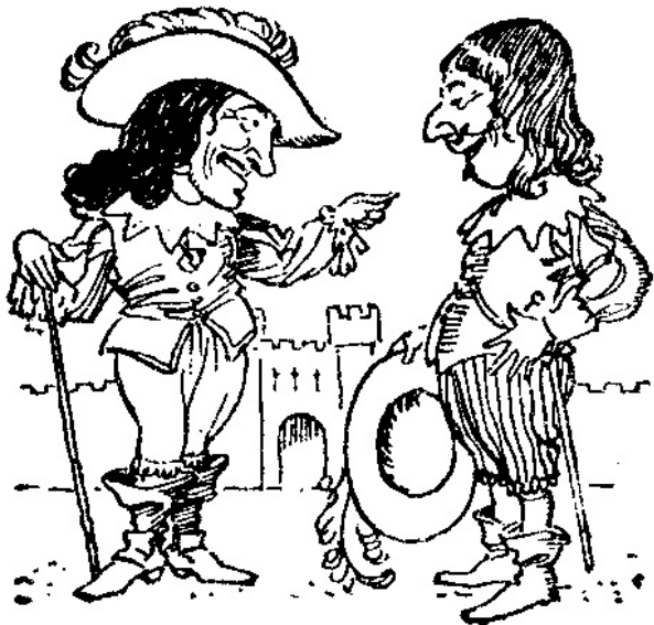
CHARLES II. REGALED HIS COURT WITH IT.