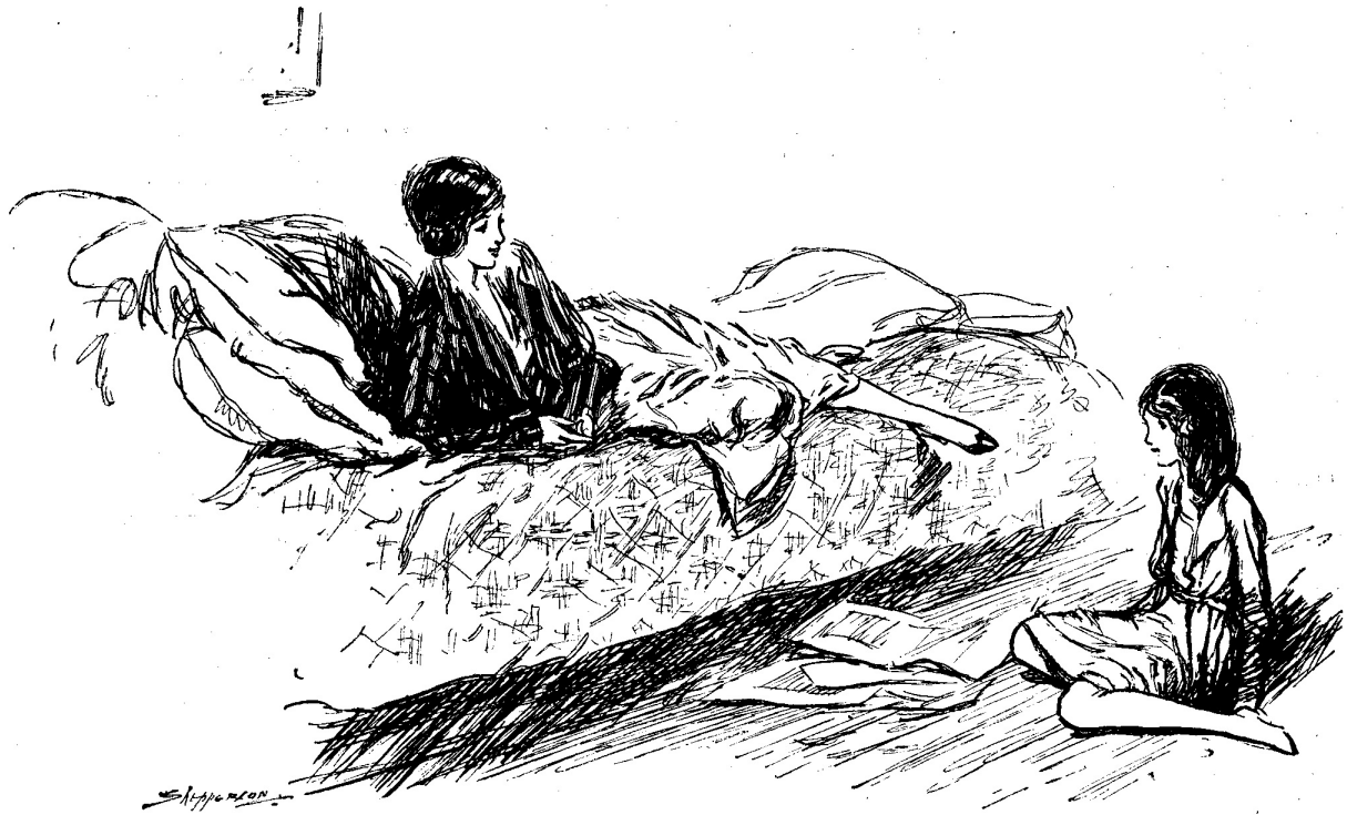
Mabel (to newly-married sister). "YOU DON'T MIND ME STILL CALLING YOU 'SYBIL,' DO YOU?"