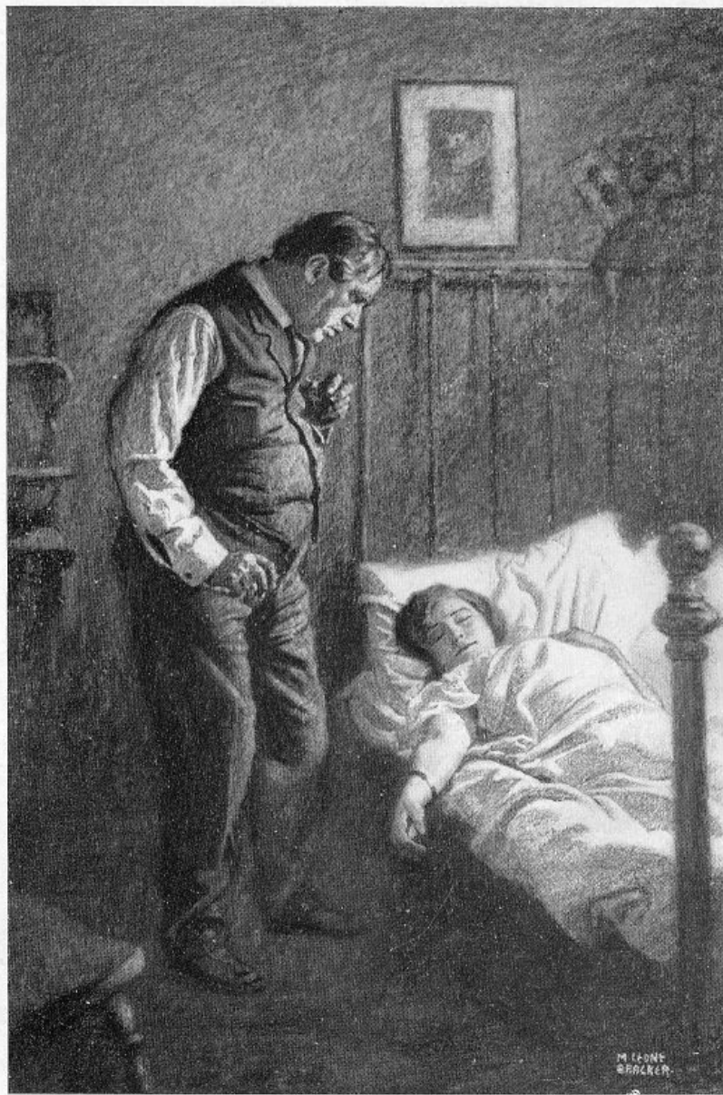
While his wife slept.

I believe he was frantic with fear, after he had done it. Then it occurred to him that if he made the body unrecognizable, he would be safe enough. On that quiet Sunday night, when Mr. Reynolds reported all peaceful in the Ladley room, he had cut off the poor wretch's head and had tied it up in a pillow-slip weighted with my onyx clock!