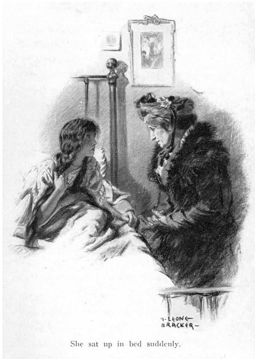
She sat up in bed suddenly.

"I know one who does," I said, smiling. But she sat up in bed suddenly and looked at me with her clear childish eyes.