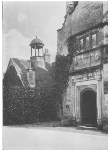
"SIDE VIEW OF MANOR HOUSE."

Then come the roses--the beautiful June roses--the nimum breves flores of Horace. But the roses of the Cotswolds are not so short lived for all that Horace has sung: you may see them in the cottage gardens from the end of May until Christmas.