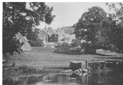
"A FARMHOUSE BY THE COLN."

At the same time it must be remembered that in spite of "hard times" and "low prices," as affecting the farmers, the agricultural labourer is better off to-day than he has ever been in past times. Food is very much cheaper and wages are higher. The farmers seem to be more liberal in bad times than in good. It is the same in all kinds of business. Except injustice there is no more hardening influence in the affairs of life than success. It seems often to dry up the milk of human kindness in the breast, and make us selfish and grasping.