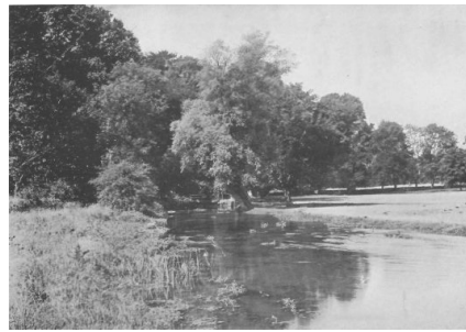
"THE COLN NEAR BIBURY."

It has been said that "the test of a river is its power to drown a man." There is doubtless a peculiar grandeur about the roaring torrent; but to me there is a still greater charm in the gentle flow of a south country trout stream, such as abound in Hampshire, Wiltshire, and in the Cotswolds. I do not think the Coln is capable of drowning a man, though one of the Peregrine family told me the other day that the only two men who ever bathed in our stream died soon afterwards from the shock of the intensely cold water! But then, it must be remembered that the old prejudice against "cold water" still lingers amongst the country folk of Gloucestershire; so that this story must always be taken cum grano salis .