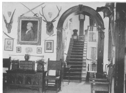
"INTERIOR OF MANOR HOUSE."

A copy of the Magna Charta, a suit of mediaeval armour, several rusty helmets (Cromwellian and otherwise), antlers of several kinds of deer, and a variety of old swords, pistols, and guns were the objects that chiefly attracted my attention. The walls were likewise adorned with a large number of heraldic shields.