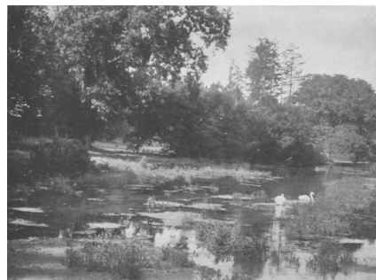
"IN THE GARDEN."

There are many country houses that are shut up for the greater part of the year for other reasons than agricultural depression, often because the owner, while preferring to reside elsewhere, is too proud to let the place to a stranger. This should not be. Let these rich men who own large houses and great estates live in those houses and on those estates, or endeavour to find a tenant. We repeat that the landowners who really feel the stress of bad times for the most part do their duty nobly. They have learnt it in the severe school of adversity. It is the richer class that we should like to see taking a greater interest in their humble neighbours; and their power is great. The possessor of wealth is too often the tacit upholder of the doctrine of laissez faire . The times we live in will no longer allow it. Let us be up and doing. In many small ways we may do much to promote good fellowship, and bitterness and discontent shall be no longer known in the rural villages of England.