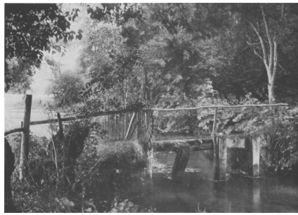
"THE "PILL" BRIDGE."

Sometimes as you are walking under the trees on the banks of the Coln you come across a little heap of chipped wood lying on the ground. Then you hear "tap, tap," in the branches above. It is the little nuthatch hard at work scooping out his home in the bark. He sways his body with every stroke of his beak, and is so busy he takes no notice of you. The nuthatch is very fond of filberts, as his name implies. You may see him in the autumn with a nut firmly fixed in a crevice in the bark of a hazel branch, and he taps away until he pierces the shell and gets at the kernel. Nuthatches, which are very plentiful hereabouts, are sometimes to be found in the forsaken homes of woodpeckers, which they plaster round with mud. The entrance to the hole in the tree is thus made small enough to suit them. Sometimes when I have disturbed a nuthatch at work at a hole in a tree, the little fellow would pop into the hole and peep out at me, never moving until I had departed.