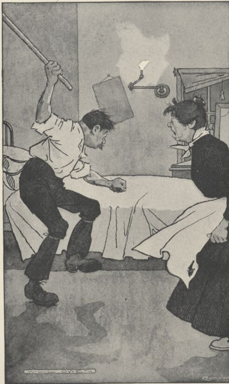
Mr. Grummit, suddenly remembering himself, stopped short and attacked the bed with extraordinary fury.

"I can hear 'im moving," whispered Mr. Grummit, pausing to take breath.