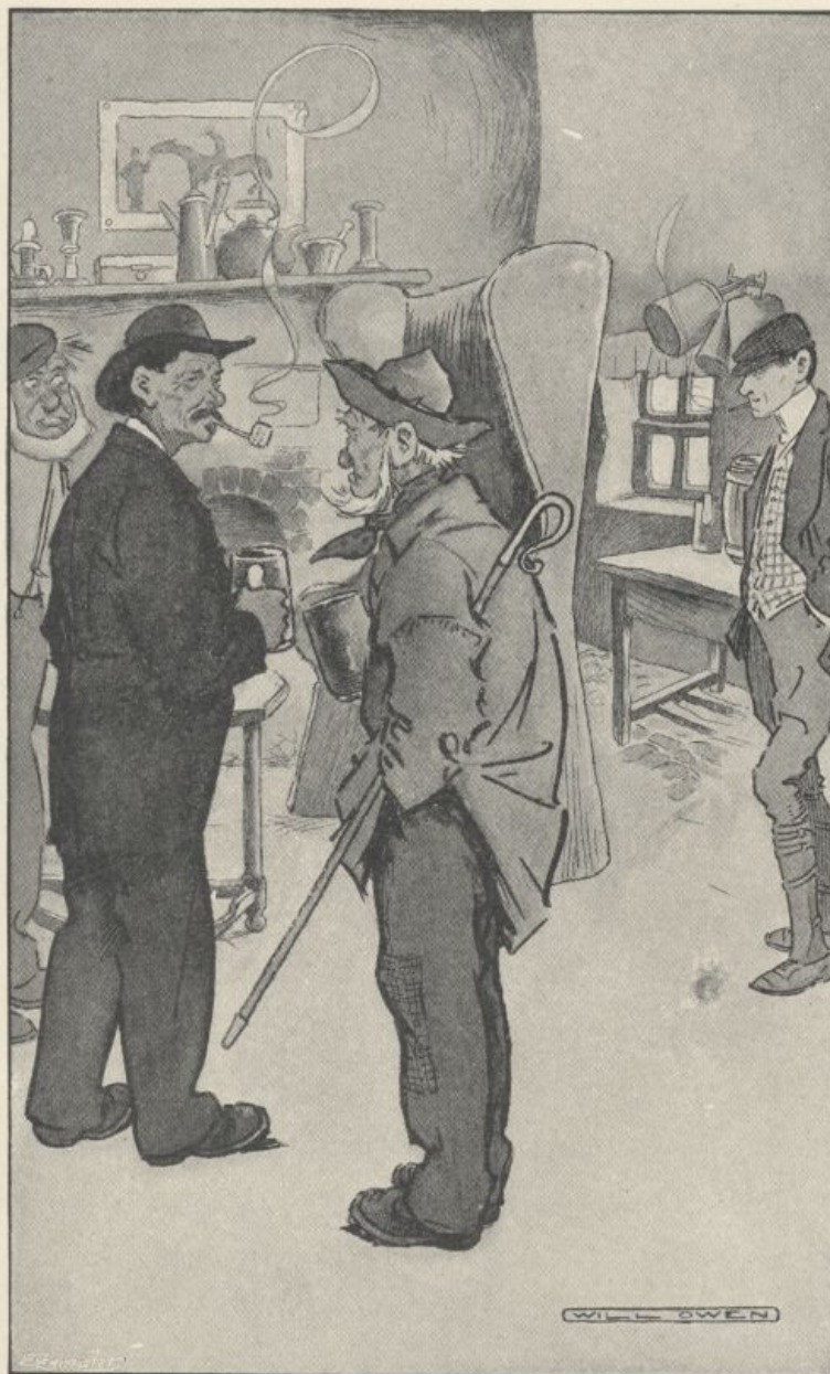
The fust Bob Pretty 'eard of it was up at the Cauliflower at eight o'clock that evening.

"It's on'y me, old pal," he ses, smiling at 'im as Henery woke up and shouted at 'im to get up.