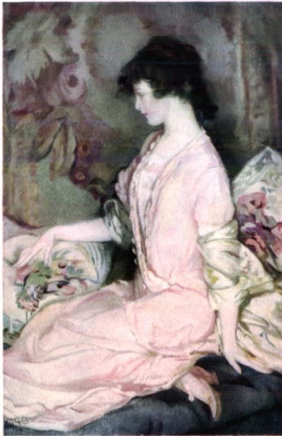
SHE SAW JARVIS BEFORE THE CURTAIN, MAKING A FIRST-NIGHT SPEECH

Many a gay-hearted girl has sat, as Bambi sat, looking off over the housetops in this "City of Beautiful Nonsense," dreaming her dreams of conquest and success. Youth makes no compromise with life. It demands all, passionately; loses all, or wins, with anguish of spirit. So it was with Bambi, the high-handed, imperious little mite. She willed Fame and Fortune for Jarvis and herself in full measure. She wanted to count in this great maelstrom of a city. She wanted two pedestals—one for Jarvis and one for herself—to lift them above the crowd. If all the young things who think such thoughts as these, in hall bedrooms and attic chambers, could mount their visioned pedestals, the traffic police would be powerless, and all the road to Albany lined like a Hall of Fame.