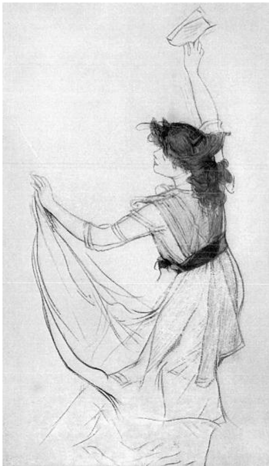
BAMBI FLUTTERED THE JOY-BRINGING LETTER ABOVE HER HEAD AND CIRCLED THE BREAKFAST-ROOM IN A WHIRL OF HAPPINESS.

but if she's a hoss, wher' yo' goin' to keep her when yo' get her? We ain't got no barn for her."