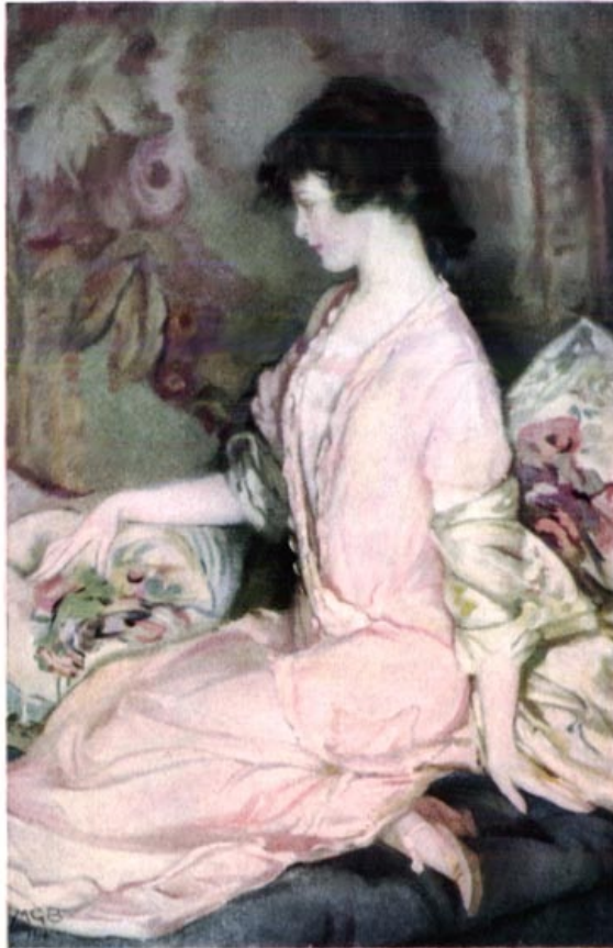
SHE SAW JARVIS BEFORE THE CURTAIN, MAKING A FIRST-NIGHT SPEECH

*** START OF THE PROJECT GUTENBERG EBOOK BAMBI ***