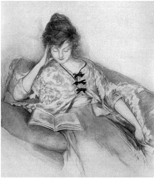
HER TALE HAD THE PLACE OF HONOUR AND WAS ILLUSTRATED BY JAMES MONTGOMERY FLAGG, THE SUPREME DESIRE OF EVERY YOUNG WRITER.

the first story indifferently, just to squeeze the full joy out of it. Then she pounded a pile of pillows into shape, drew her feet up under her, and began to read her own work. She smiled a good deal, she chuckled, finally she laughed outright, hugging herself. At this unfortunate moment Jarvis appeared. She looked as guilty as a detected criminal.