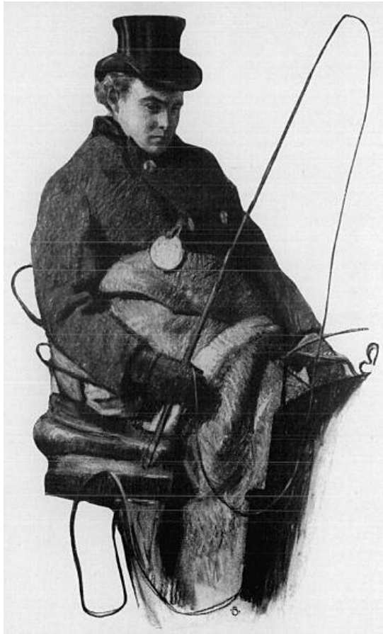
HE TAUGHT HIMSELF TO ABANDON HIS OLD INTROSPECTIVE HABITS DURING THESE DAYS ON THE BOX.

He taught himself to abandon his old, introspective habits during these days on the box, and forced his attention to fix itself upon the crowds, his customers, the whole uptown panorama, so different from the night crowds he sought. He recalled Bambi's saying to him that until he learned not to exclude any of the picture he would never do big work. Her words had a tantalizing way of coming back to him, things she had tossed off in the long ago of their visit to New York together. He longed for her vivid phrasing, her quick dart at the heart of the things they talked of. It seemed incredible now that he had ever taken her as a matter of course. As for the enigma of her marrying him, he never ceased to ponder it.