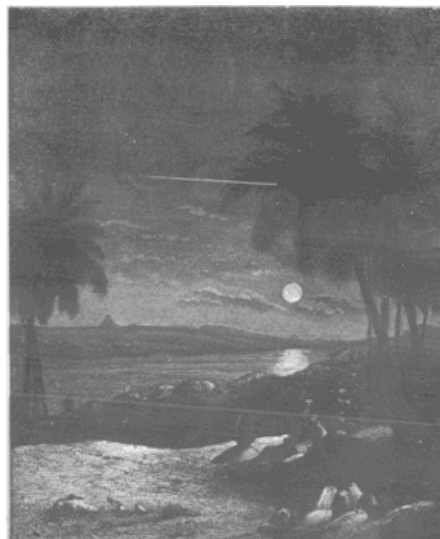
The River Nile by Moonlight.

The waters still spread o'er the earth, And slowly did abate; For seven days more within the ark, He patiently did wait.