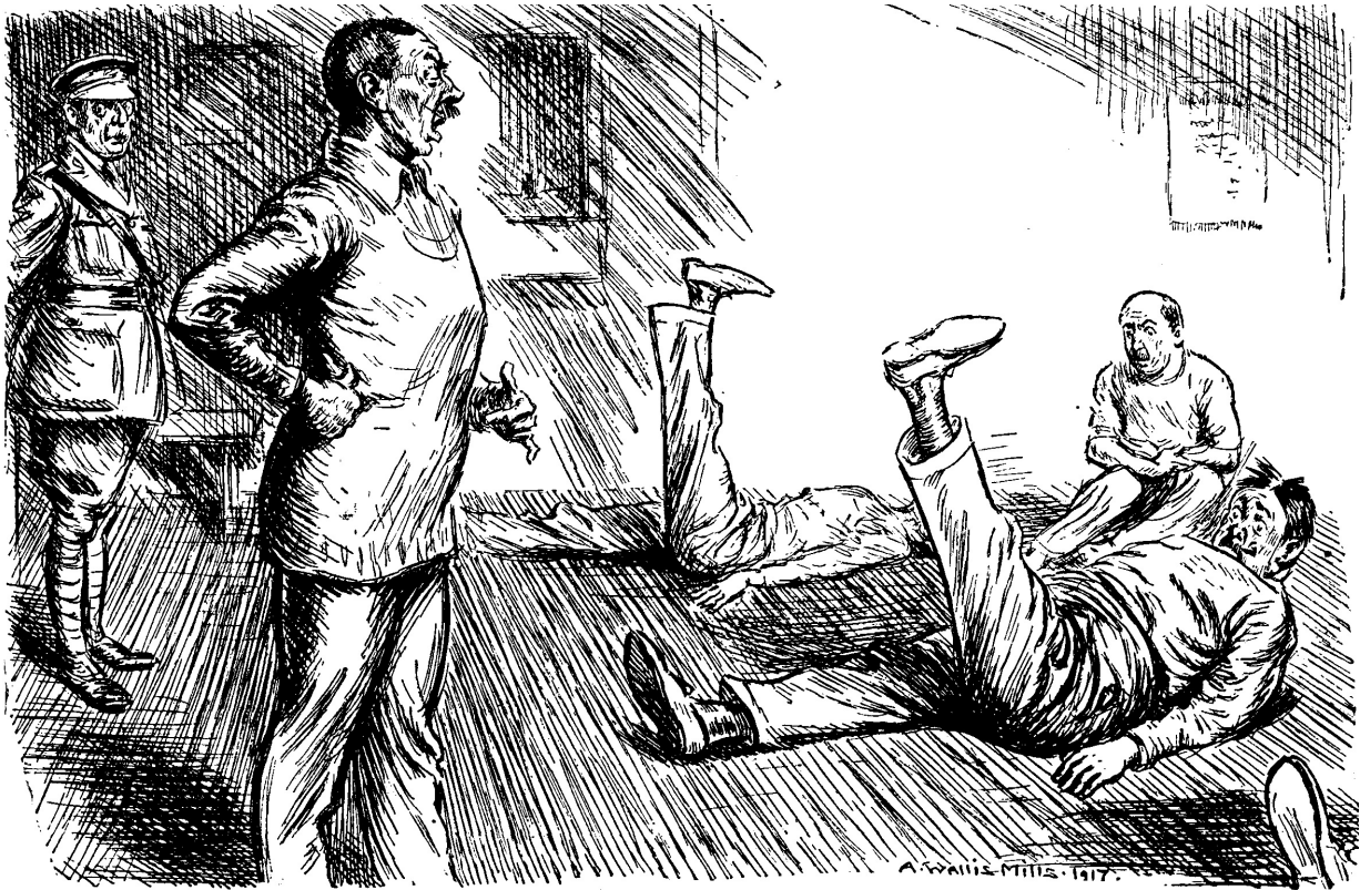
Sergeant (instructing squad of volunteers in physical drill). "THIS 'ERE HEXERCISE IS INTENDED TO 'ARDEN THE MUSCLES OF THE STUMMICK AND MAKE IT HIMPERVIOUS TO GERMAN BULLETS HIN CASE OF HINVASION."