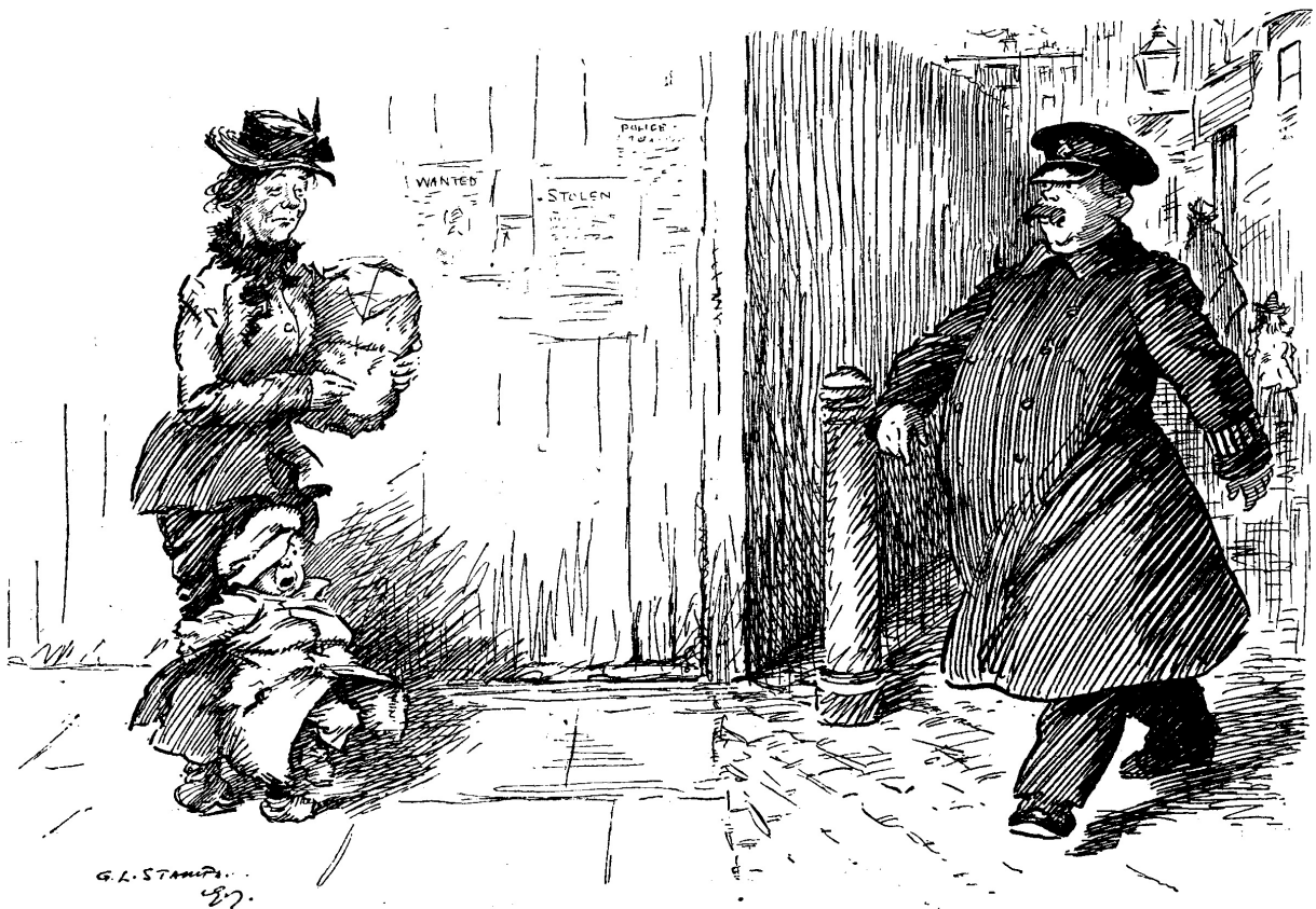
Urchin (with an inborn terror of the Force). "OO, MUVVER! IT WON'T, WILL IT?"

Don't be surprised if you hear of some sensational political developments in the near future. The Minister who said recently that the inevitable sequel to war was peace, was, in the opinion of those competent to judge but, by reason of their official position, unable to criticise, hinting at proposals which, if the signs and portents of the time go for anything, would have far-reaching effects on the question of Electoral Representation. I will say no more. Time alone will disclose my meaning.