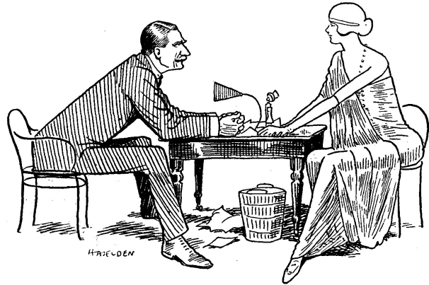
THE LIGHTER SIDE OF EDITORIAL LIFE.