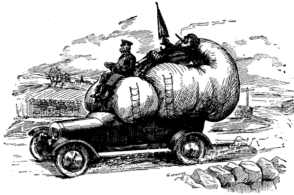
JOY-RIDING UP-TO-DATE. THE UNDEFEATED WAR-PROFITEER.