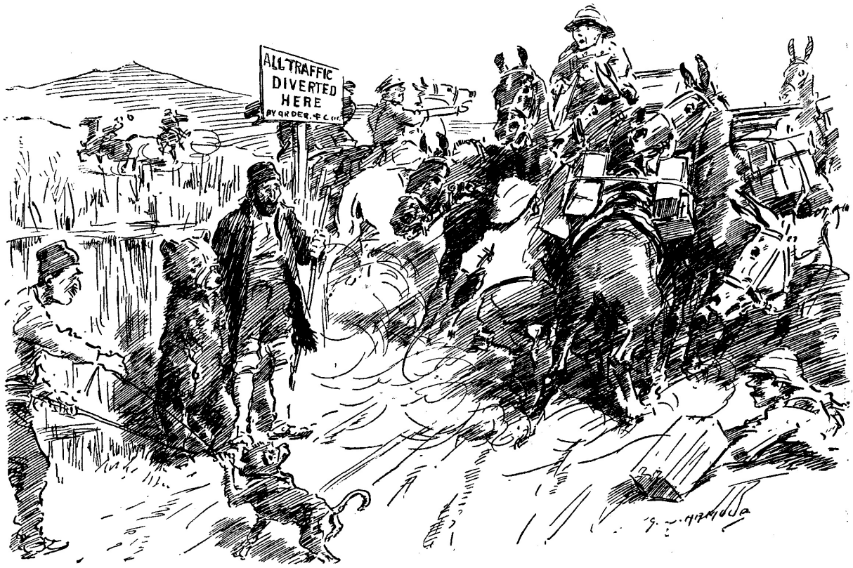
"DIVERSION" IN THE BALKANS.