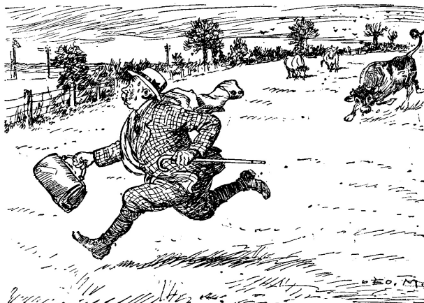
A CONSOLING THOUGHT.