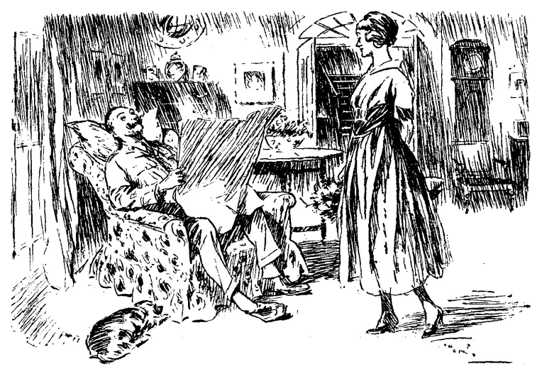
"DO TELL ME, UNCLE, ALL ABOUT THIS PERSIFLAGE YOU PUT ON YOUR TENTS."

I have been wondering if there are any other writers of serial stories whose readers would not suffer if similar visitations of inevitability came to them.