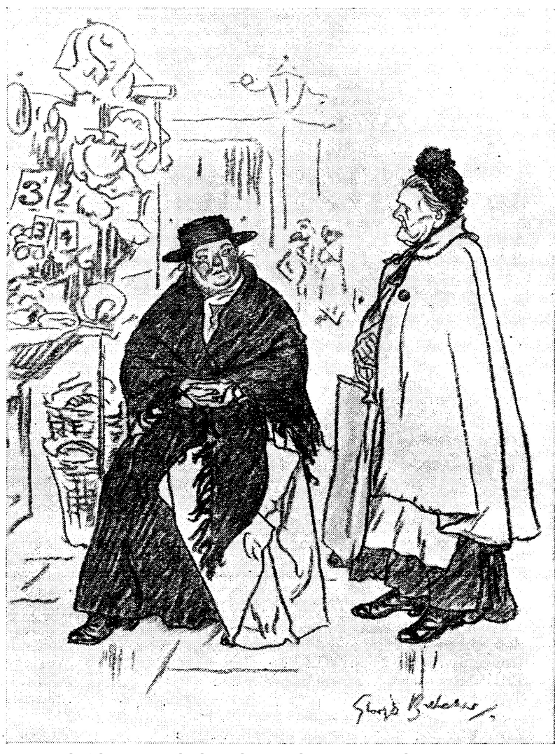
Stout Lady ( discussing the best thing to do in an air-raid ). "WELL, I ALWAYS RUNS ABOUT MESELF. YOU SEE, AS MY 'USBAND SEZ, AN' VERY REASONABLE TOO, A MOVIN' TARGIT IS MORE DIFFICULT TO 'IT."