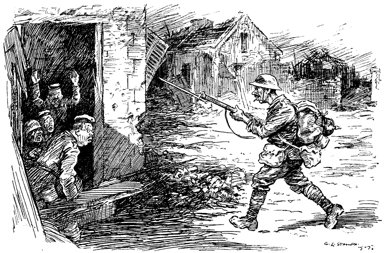
Tommy. "'ANDS UP, ALL OF YER, I'M GOIN' ON LEAVE TERMORRER. AIN'T GOT NO TIME TO WASTE."