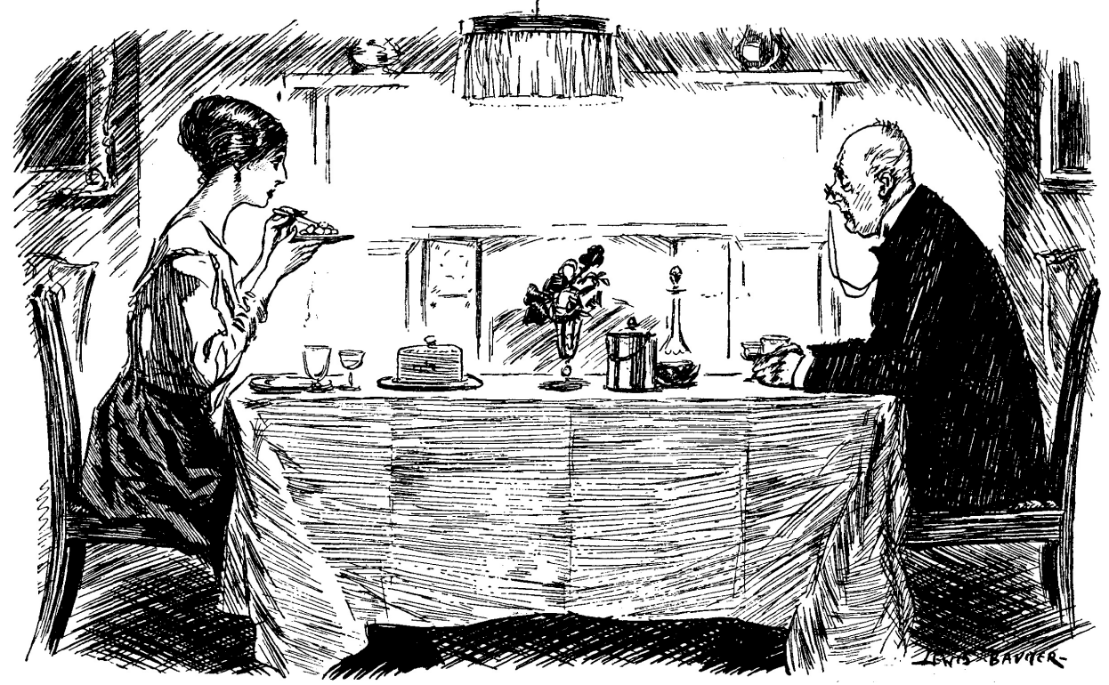
"WELL, UPON MY WORD! AFTER ALL THE TROUBLE I HAD TO GET A QUARTER OF A POUND OF BUTTER, THE COOK'S SENT UP MARGARINE. I SHOULD HATE THE MAIDS TO GO SHORT, BUT I DO THINK WE OUGHT TO SHARE THINGS."