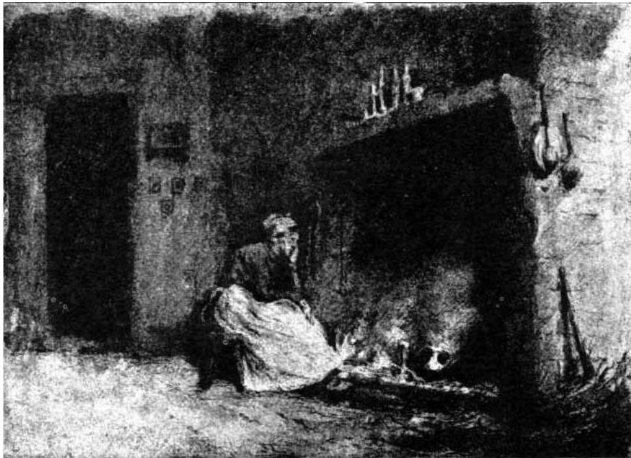
THE ROOM IN THE OLD GALLERY.

"We will go to her, like children to a grandmother, etc. The others have no delicacy of sentiment, etc. And she will thus learn who really remember, really love her, etc."