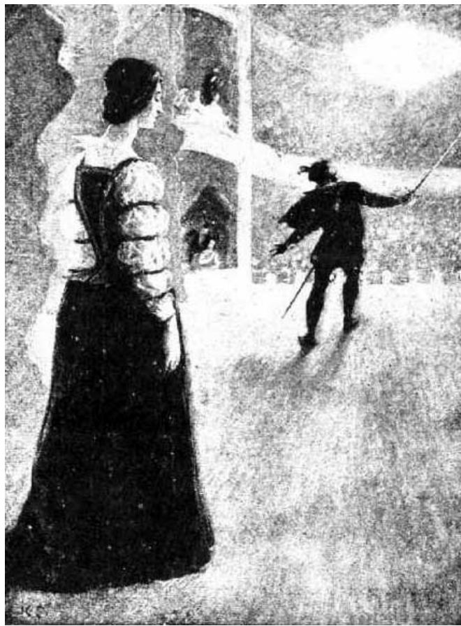
"TO POSE IN ABJECT PATIENCE AND AWKWARDNESS."

Looking at her—how it came over one! The music, the lights, the scene; the fat soprano confiding to her the fact of the "amour extrême" she bears for the tenor, to which she, the dugazon , does not even try to listen; her eyes wandering listlessly over the audience. The calorous secret out, and in her possession, how she stumbles over her train to the back of the stage, there to pose in abject patience and awkwardness, while the gallant baritone, touching his sword, and flinging his cape over his shoulder, defies the world and the tenor, who is just recovering from his "ut de poitrine" behind the scenes.