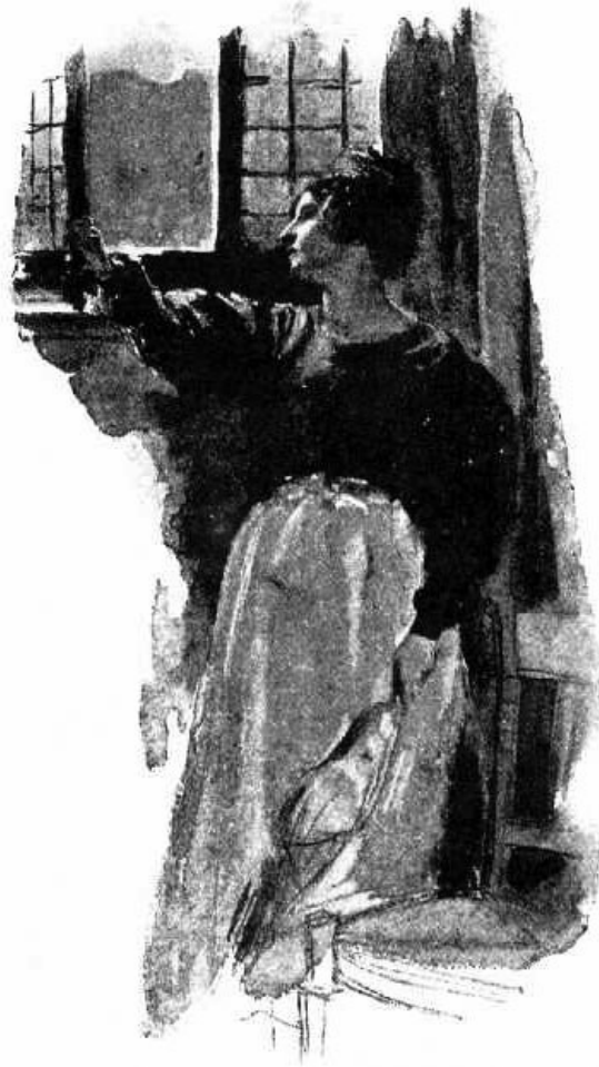
"HER HEART DROVE HER TO THE WINDOW".

It was just past the middle of the week, a Thursday night. The moon was so bright the colors of the lilies could be seen, and the singing, so sweet, so far-reaching—it was the essence of the longing of love. Then it was that the miracle happened to her. Miracles are always happening to the Acadians. She could not sleep, she could not stay in bed. Her heart drove her to the window, and kept her there, and—among the civilized it could not take place, but here she could sing as she pleased in the middle of the night; it was nobody's affair, nobody's disturbance. "Saint Ann! Saint Joseph! Saint Mary!" She heard her song answered! She held her heart, she bent forward, she sang again. Oh, the air was full of music! It was all music! She fell on her knees; she listened, looking at the moon; and, with her face in her hands, looking at Zepherin. It was God's choir of angels, she thought, and one with a voice like Zepherin! Whenever it died away she would sing again, and again, and again—