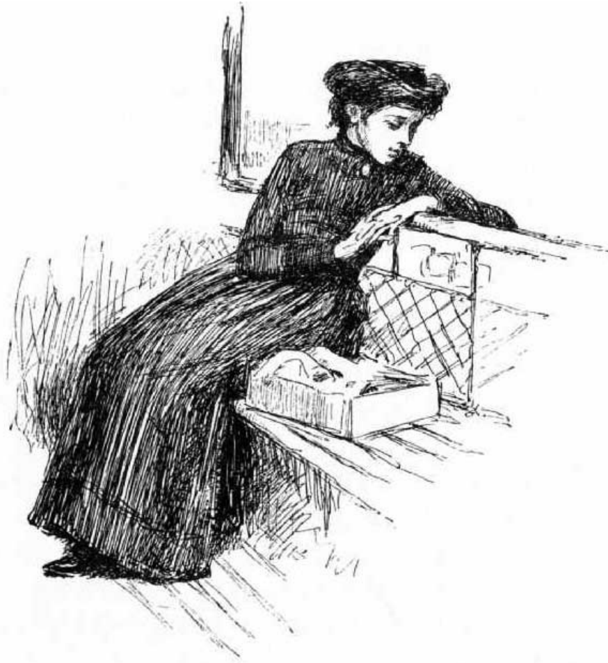
WATCHING A LANDING.

And it was worth seeing—the balancing and chasséeing and waltzing of the cumbersome old boat to make a landing. It seemed to be always attended with the difficulty and the improbability of a new enterprise; and the relief when it did sidle up anywhere within rope's-throw of the spot aimed at! And the roustabout throwing the rope from the perilous end of the dangling gang-plank! And the dangling roustabouts hanging like drops of water from it—dropping sometimes twenty feet to the land, and not infrequently into the river itself. And then what a rolling of barrels, and shouldering of sacks, and singing of Jim Crow songs, and pacing of Jim Crow steps; and black skins glistening through torn shirts, and white teeth gleaming through red lips, and laughing, and talking and—bewildering! entrancing! Surely the little convent girl in her convent walls never dreamed of so much unpunished noise and movement in the world!