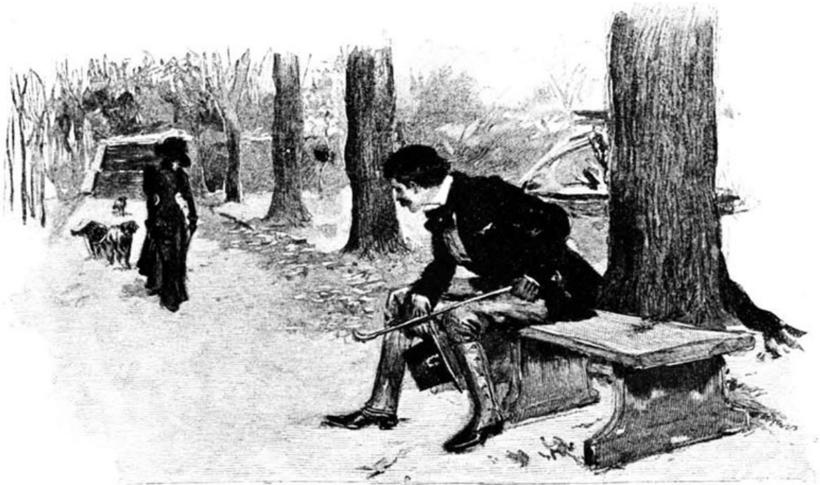
"WALKING AWAY WITH A SHRUG OF THE SHOULDERS."

Well! Every one knows what happened after '59. There is no need to repeat. The history of one is the history of all. But there was this difference—for there is every shade of difference in misfortune, as there is every shade of resemblance in happiness. Mortemart des Islets went off to fight. That was natural; his family had been doing that, he thought, or said, ever since Charlemagne. Just as naturally he was killed in the first engagement. They, his family, were always among the first killed; so much so that it began to be considered assassination to fight a duel with any of them. All that was in the ordinary course of events. One difference in their misfortunes lay in that after the city was captured, their plantation, so near, convenient, and rich in all kinds of provisions, was selected to receive a contingent of troops—a colored company. If it had been a colored company raised in Louisiana it might have been different; and these negroes mixed with the negroes in the neighborhood,—and negroes are no better than whites, for the proportion of good and bad among them,—and the officers were always off duty when they should have been on, and on when they should have been off.