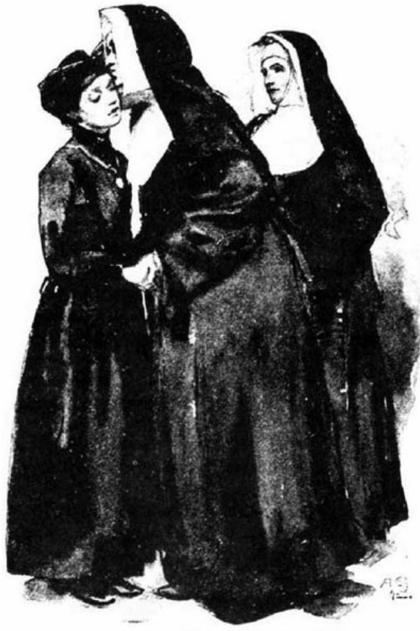
THE SISTERS BID HER GOOD-BY.

Unless the captain or the clerk remembered to fetch her out in front, she would sit all day in the cabin, in the same place, crocheting lace, her spool of thread and box of patterns in her lap, on the handkerchief spread to save her new dress. Never leaning back—oh, no! always straight and stiff, as if the conventual back board were there within call. She would eat only convent fare at first, notwithstanding the importunities of the waiters, and the jocularities of the captain, and particularly of the clerk. Every one knows the fund of humor possessed by a steamboat clerk, and what a field for display the table at meal-times affords. On Friday she fasted rigidly, and she never began to eat, or finished, without a little Latin movement of the lips and a sign of the cross. And always at six o'clock of the evening she remembered the angelus, although there was no church bell to remind her of it.