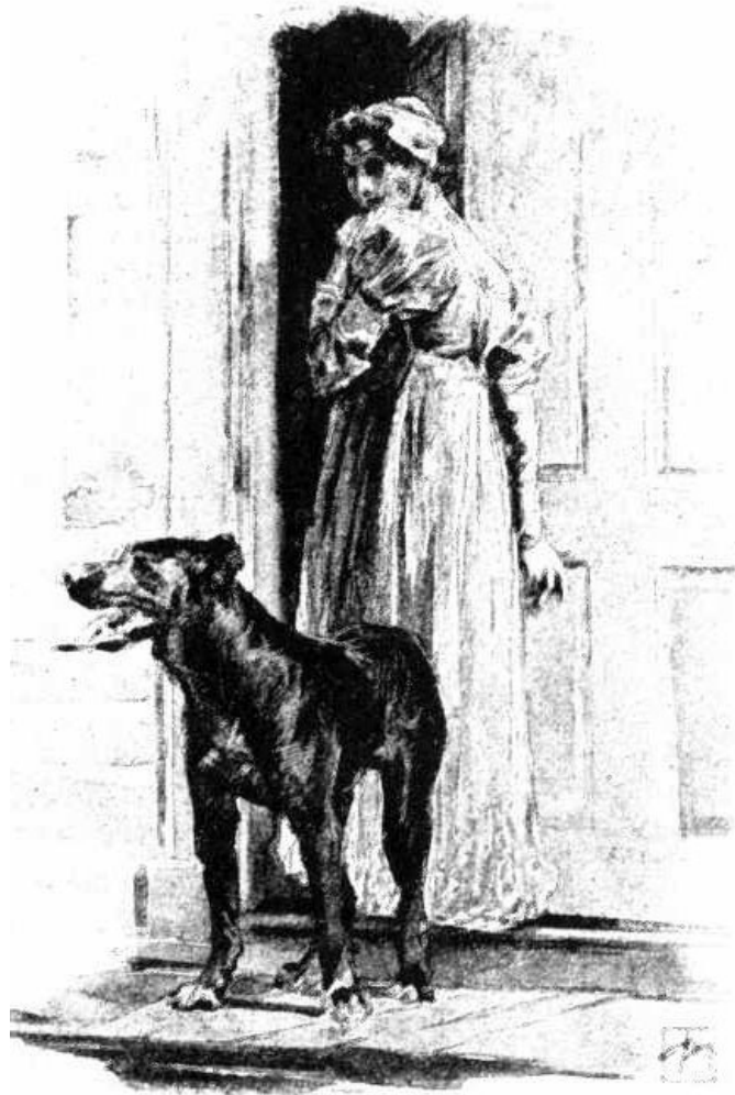
"TURNED TO HER DOMESTIC DUTIES."

So, early in a morning as beautiful as the preceding one, mounted on her own stanch mare Maid Marion, she ambled down the green over-hung forest-road, in the vista of which she had watched her husband disappear the day before; thinking about what she had to buy, and thinking, no doubt, much more, as brides will, of the absent lord and master—as brides of those days loved to consider and denominate their husbands.