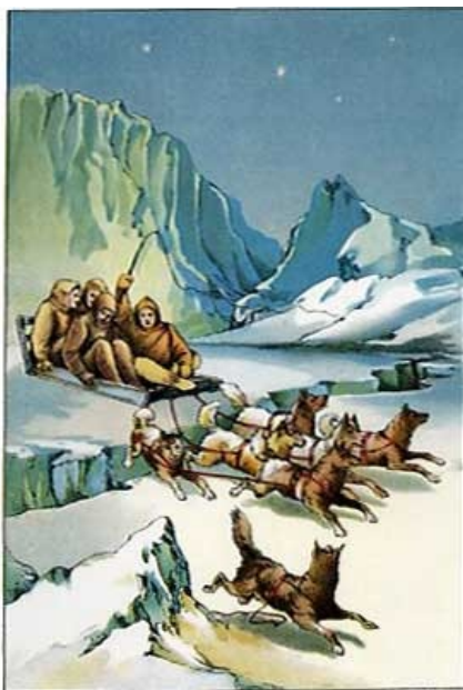
DARING LEAP AT FULL SPEED

As the captain descended to the cabin the men gave a final cheer, and in ten minutes they were working laboriously at their various duties.