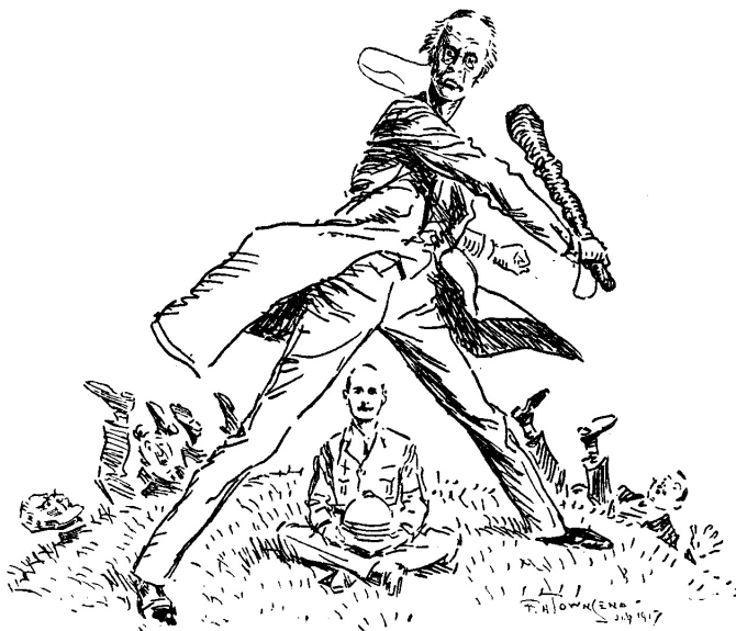
LORD HARDINGE'S CHAMPION.

Thursday, July 19th. —The only thing that keeps Mr. Reddy at Westminster is his delight in acting as Chorus to Major Pretyman Newman. Whenever the hon. and gallant Member asks a question Mr. Reddy, in a piping voice of remarkable carrying power, immediately puts another, designed to throw doubt upon his personal prowess or his military capacity. Major Newman had several Questions on the Paper this afternoon, and, as he had just announced the withdrawal of his valuable support from a Government so lost to all sense of propriety as to welcome Messrs. Churchill and Montagu to its fold, Mr. Reddy's comments were awaited with pleasurable anticipation.