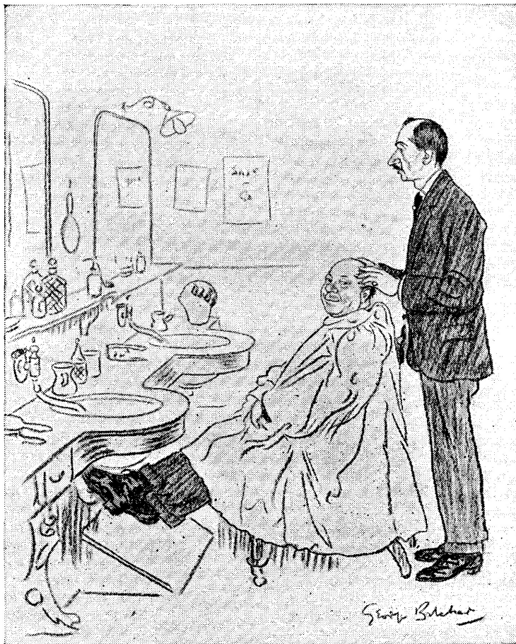
Hairdresser (with a view to business—to customer, who is getting rapidly bald). "There are plenty of hairdressers, you know, Sir, who profess to make a wig; but, when you've got it on, it looks nothing like a wig at all, Sir."