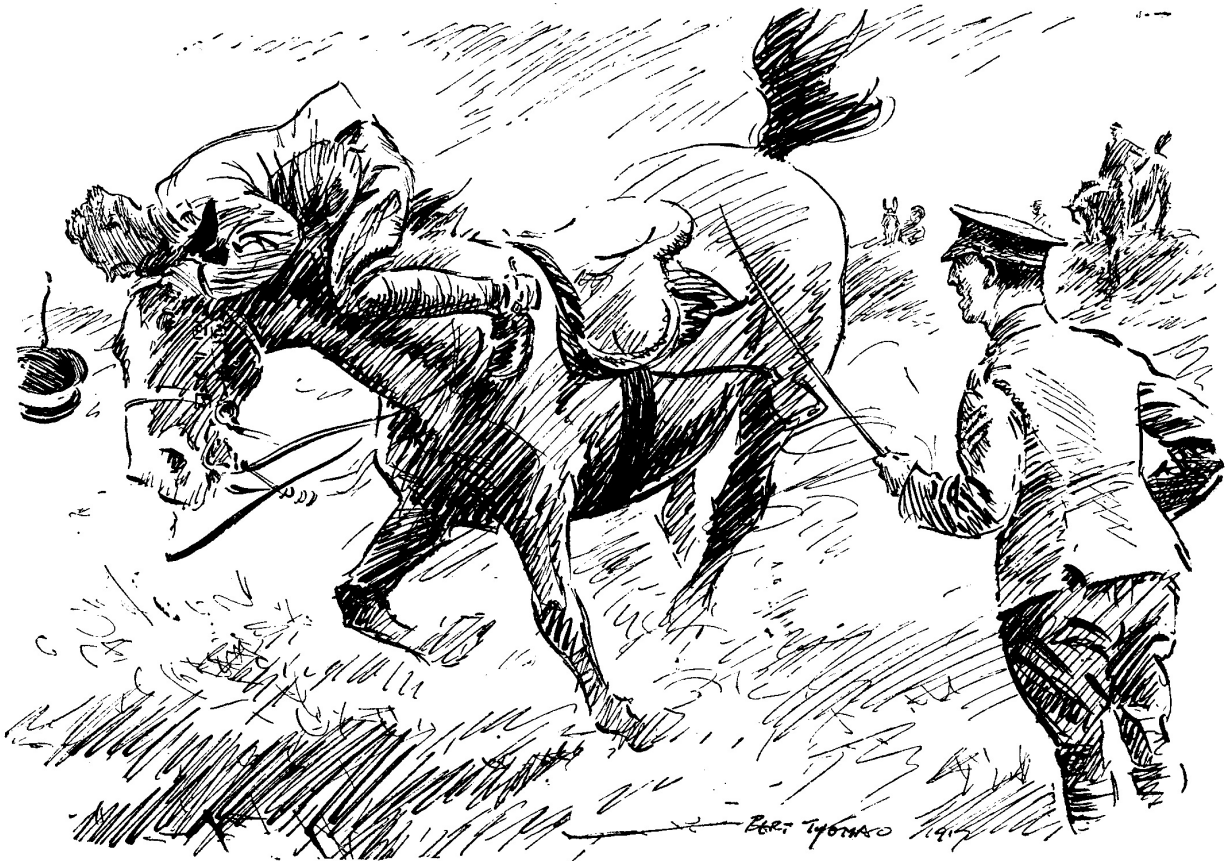
Sergeant (to cadet). "SIT BACK, SIR! SIT BACK! THINK WOT A BLINKIN' FOOL YOU'D LOOK IF 'IS 'EAD WAS TO COME ORF!"