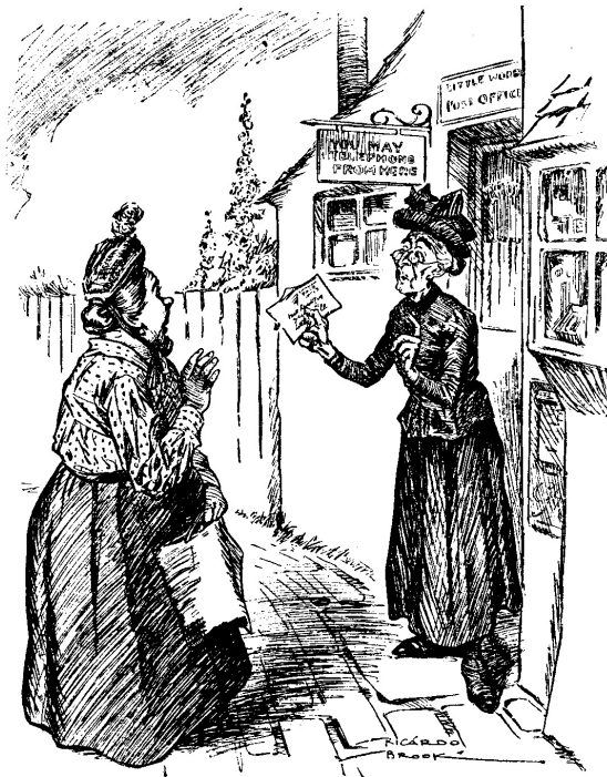
Ancient Heroine. "IT'S BEEN A TRYIN' TIME FOR ME, MRS. BLOGGS. MY SAVIN'S-BANK BOOK WAS UP IN LUNNON ALL THROUGH THE AIR-RAID."

"It may be the bravery of ignorance that induces us to take this point of view, but the locality excuses ignorance to some extent, and the bravery still exists: Ovid has a line that might be learnt with advantage by our readers—