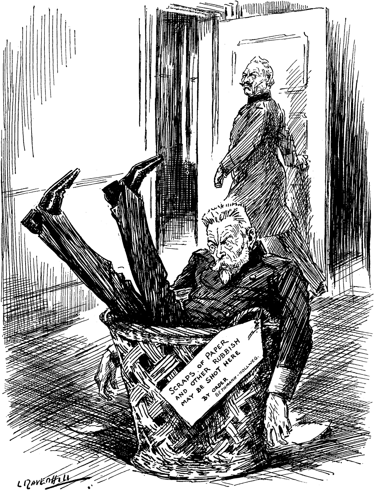
THE SCRAPER SCRAPPED.