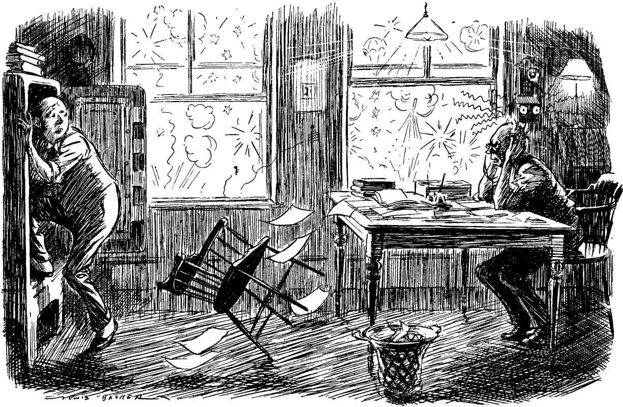
Busy City-man to his Partner (as one of the new air-raid warnings gets to work). "IF YOU'LL LEAVE ME IN HERE FOR THE WARNINGS I'LL CARRY ON WHILE YOU TAKE SHELTER DURING THE RAIDS."