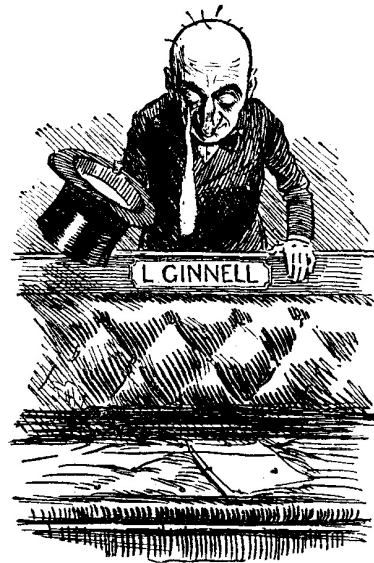
THE EMPTY SEAT.