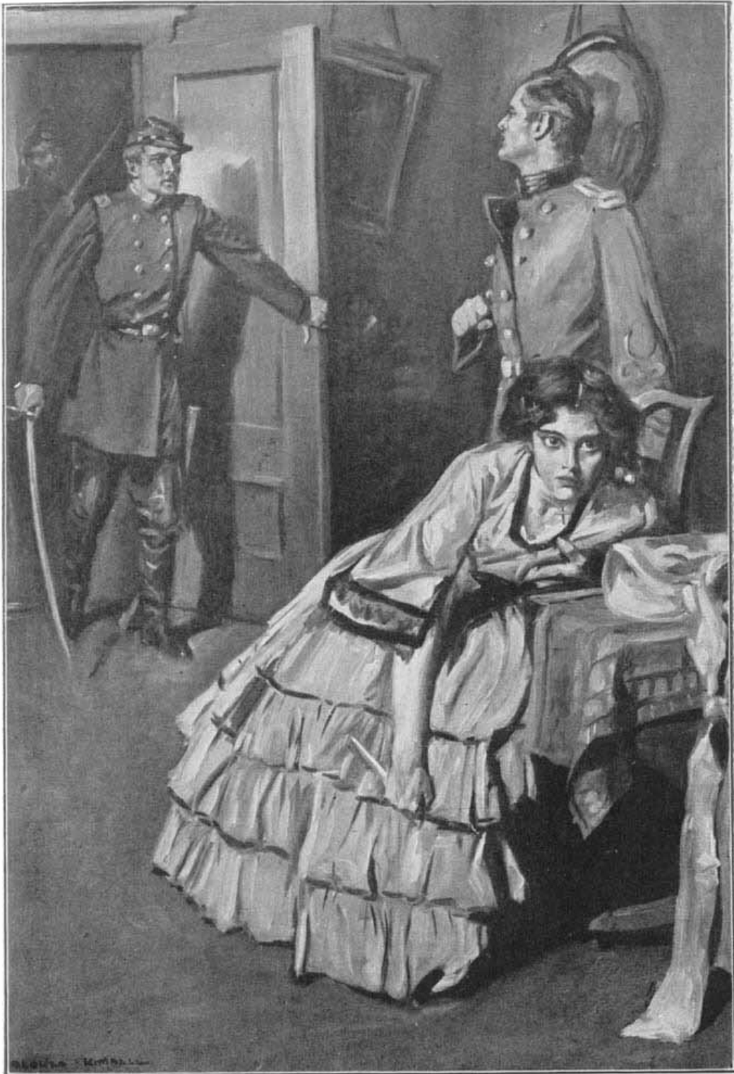
She dropped into a seat, staring like one demented

He ceased and listened. Certainly, somewhere, some one had moaned. Sounds throughout the house were growing, as if final orders had set many in motion at once. For some cause unrelated to him or to Anna, to Flora or the silent boat, bugles and drums were assembling the encamped brigade. Suddenly, not knowing why, he flashed round. Flora was within half a step of him with her right arm upthrown. He seized it, but vain was the sparring skill that had won at the willow pond. Her brow was on his breast, the knife was in her left hand, she struck with thrice her natural power, an evil chance favored her, and, hot as lightning, deep, deep, the steel plunged in. He gulped a great breath, his eyes flamed, but no cry came from him or her. With his big right hand crushing her slim fingers as they clung to the hilt, he dragged the weapon forth and hurled her off.