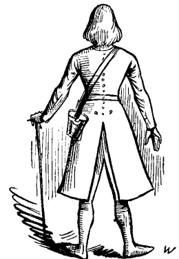
Back View of New Sarah Jeanne overcoat for race meetings.

SARAH JEANNE of Arc. SARAH wrapt up in the visionary creation is comparatively lost in the part; that is, until she comes out magnificently in the last scene but one. Otherwise, except to look the Martyr, and to languish, nothing much for SARAH to do. Cathedral scene here rivals that at Covent Garden. SARAH wins and thrills the audience: her voice soothes them in their most ruffled