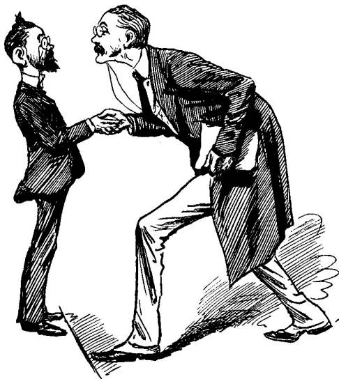
Right Hon. A. Balfour. "My dearest Tim, 'for this relief much thanks!'"