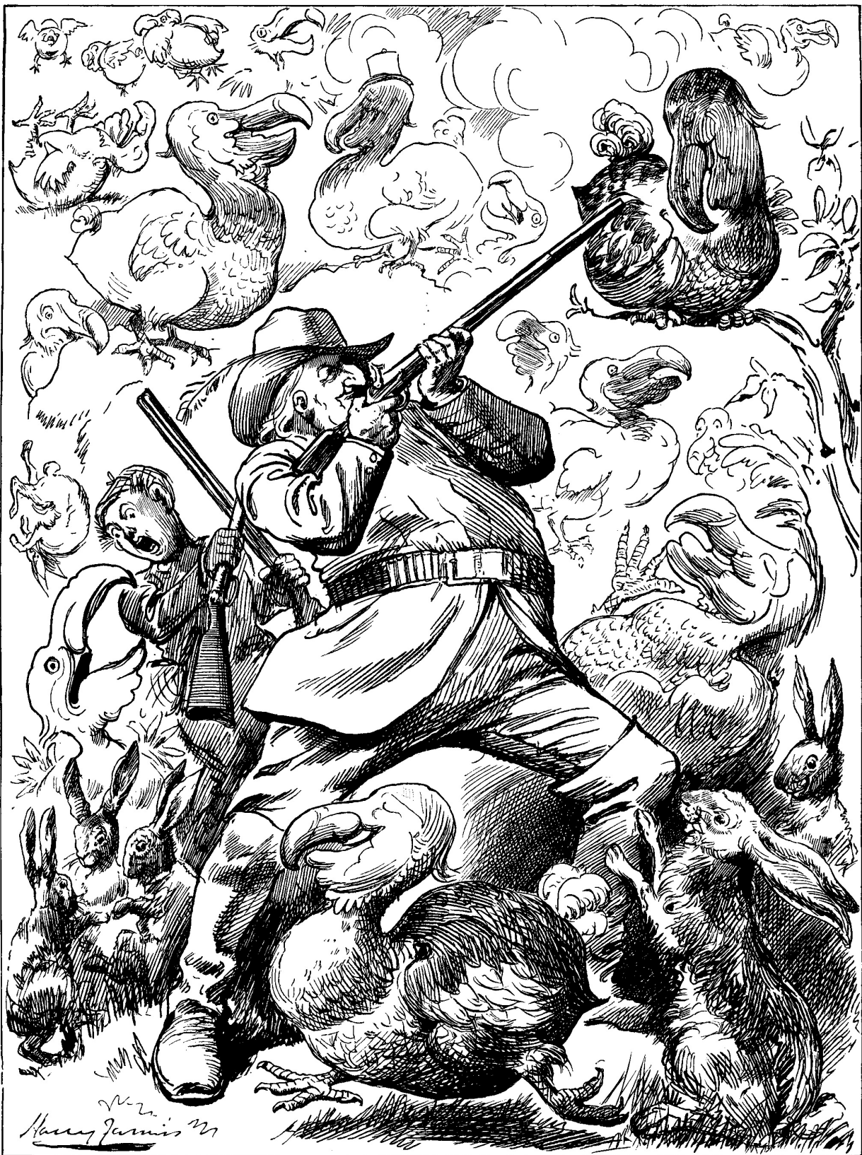
From Report of Debate on Hares Preservation Bill, June 26.—"They (the other Members of Parliament) could not go out and kill 300 Dodos,"—but evidently he (Sir W.V. HARCOURT) could, and here he is—caught in the act!