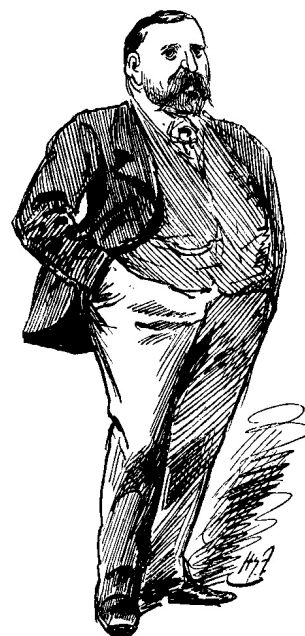
A Maiden Speech.

1.A. By reading or using any part of this Project Gutenberg™ electronic work, you indicate that you have read, understand, agree to and accept all the terms of this license and intellectual property (trademark/copyright) agreement. If you do not agree to abide by all the terms of this agreement, you must cease using and return or destroy all copies of Project