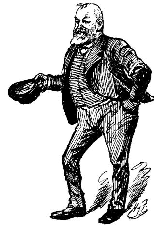
"Toby, M.P., I presume?"

"Yes," said Prince ARTHUR, "but I hope he's not going to say anything about Irish business. When he's in this mood, I prefer he should address himself to my dear friend JOKIM."