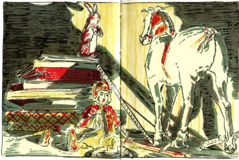
The Skin Horse Tells His Story

"The Boy's Uncle made me Real," he said. "That was a great many years ago; but once you are Real you can't become unreal again. It lasts for always."