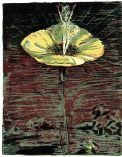
The Fairy Flower

And she held the little Rabbit close in her arms and flew with him into the wood.