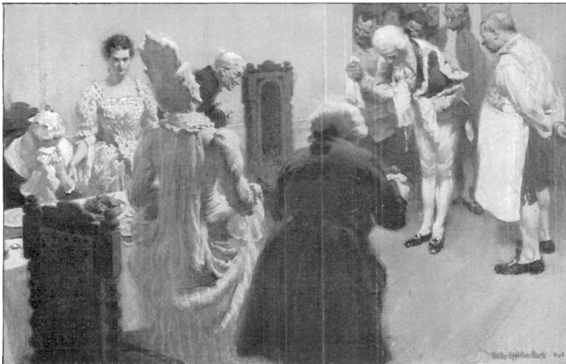
'YOUR LADYSHIP'S MOST HUMBLE SERVANT,' HE SAID.

'But why should they sit down with her?' said Sir George the fashionable, slightly raising his eyebrows.