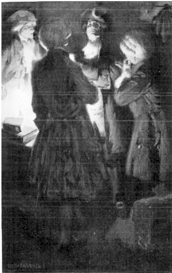
'TOMMY, WHO IS--THIS-FELLOW?' HE CRIED.

It was well that they did, for he had come to the end of his patience. One man steps out of a carriage, picks up a handkerchief, and lives to wear a Crown. Another takes the same step; it lands him in a low squabble from which he may extricate himself with safety, but scarcely with an accession of credit. Sir George belonged to the inner circle of fashion, to which neither rank nor wealth, nor parts, nor power, of necessity admitted. In the sphere in which he moved, men