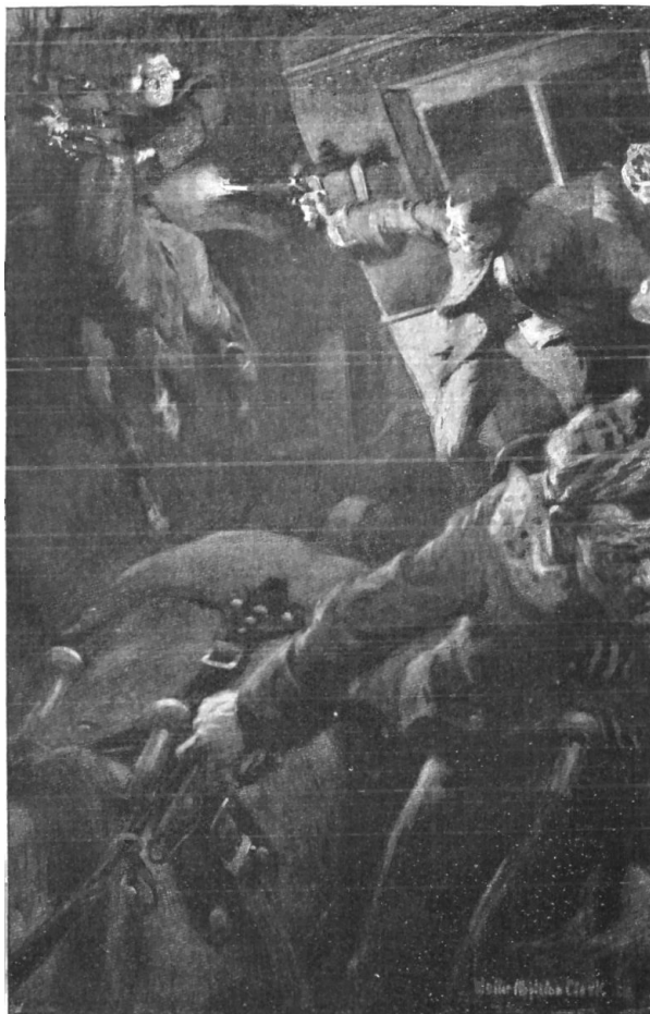
THE ANSWER WAS A BLINDING FLASH OF LIGHT AND A SHOT.

The servant and Mr. Dunborough were no more than forty yards behind him when he fell; in five seconds the man had sprung from his saddle, let his horse go, and was at his