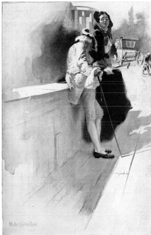
HE WOULD FALL SILENT IN JULIA'S COMPANY.

'The same. The point is, shall I resist the claim, or shall I yield to it? What do you say, ma'am?'