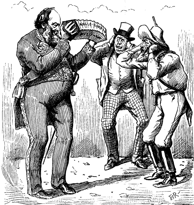
Imperial Instrumentalist (loquitur). "WHAT, NOT LIKE THE TONE OF IT? WELL, YOU DO SURPRISE ME!!!"

'Tis not, I know, the Jingo drum, Nor the "Imperial" trumpet. (The country to their call won't come, However much you stump it.) They're out of fashion; 'tis not now As in the days of "BEAKEY." People dislike the Drum's tow-row. And call the Trumpet squeaky. So I the Concertina try, As valued friends advise me. What's that you say? It's all my eye? Well, well,—you do surprise me!