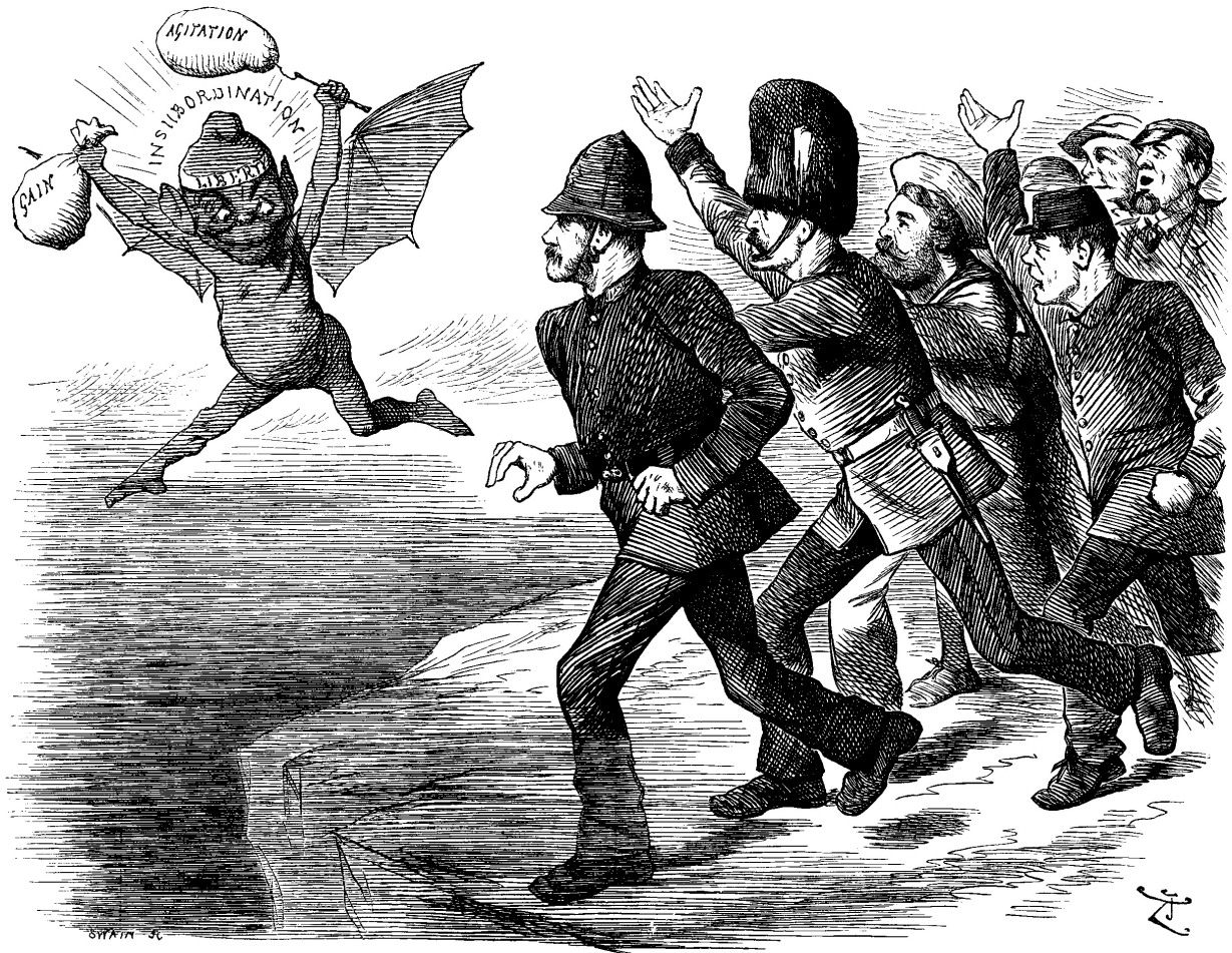
THE LYING SPIRIT.