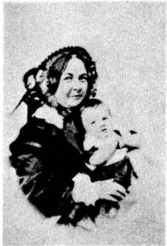
MRS. STANTON AND DAUGHTER, 1857.

Fairly at sea, I closed another chapter of my life, and my thoughts turned to what lay in the near future. James G. Birney, the anti-slavery nominee for the presidency of the United States, joined us in New York, and was a fellow-passenger on the Montreal for England. He and my husband were delegates to the World's Anti-slavery Convention, and both interested themselves in my anti-slavery education. They gave me books to read, and, as we paced the deck day by day, the question was the chief theme of our conversation.