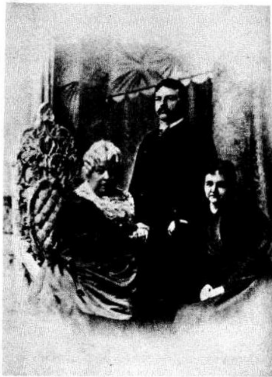
MY EIGHTIETH BIRTHDAY.

We also read Cotton Morrison's "Service of Man," which I hope will be a new inspiration to fresh labors by all for the elevation of humanity, and Carnegie's "Triumphant Democracy," showing the power our country is destined to wield and the vastness of our domain. This book must give every American citizen a feeling of deeper responsibility than ever before to act well his part. We read, too, Harriet Martineau's translation of the works of Auguste Comte, and found the part on woman most unsatisfactory. He criticises Aristotle's belief that slavery is a necessary element of social life, yet seems to think the subjection of woman in modern civilization a matter of no importance.