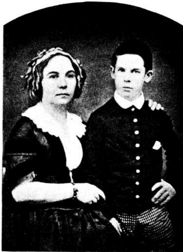
MRS. STANTON AND SON, 1854.

My nearest neighbors were a very agreeable, intelligent family of sons and daughters. But I always felt that the men of that household were given to domineering. As the mother was very amiable and self-sacrificing, the daughters found it difficult to rebel. One summer, after general house-cleaning, when fresh paint and paper had made even the kitchen look too dainty for the summer invasion of flies, the queens of the household decided to move the sombre cook-stove into a spacious woodhouse, where it maintained its dignity one week, in the absence of the head of the home. The mother and daughters were delighted with the change, and wondered why they had not made it before during the summer months. But their pleasure was shortlived. Father and sons rose early the first morning after his return and moved the stove back to its old place. When the wife and daughters came down to get their breakfast (for they did all their own work) they were filled with grief and disappointment. The breakfast was eaten in silence, the women humbled with a sense of their helplessness, and the men gratified with a sense of their power. These men would probably all have said "home is woman's sphere," though they took the liberty of regulating everything in her sphere.