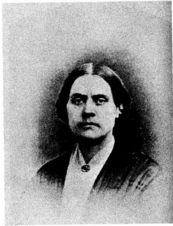
Susan B. Anthony 1820 - Feb. 15 - 1896

The reports of the conventions held in Seneca Falls and Rochester, N.Y., in 1848, attracted the attention of one destined to take a most important part in the new movement—Susan B. Anthony, who, for her courage and executive ability, was facetiously called by William Henry Channing, the Napoleon of our struggle. At this time she was teaching in the academy at Canajoharie, a little village in the beautiful valley of the Mohawk.