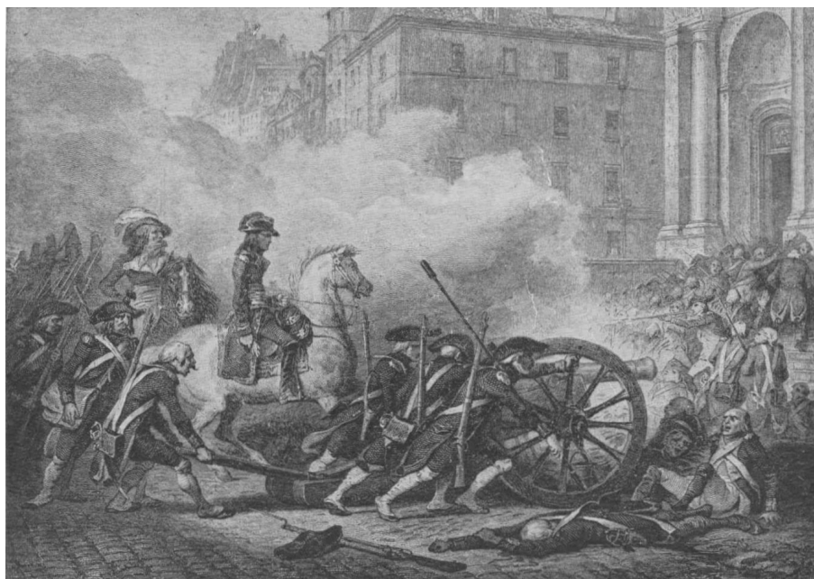
General Bonaparte suppressing the Revolt of the Sections.

*** START OF THE PROJECT GUTENBERG EBOOK QUEEN HORTENSE: A LIFE PICTURE OF THE NAPOLEONIC ERA ***