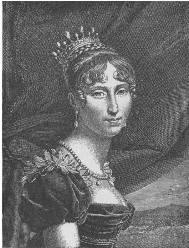
Portrait of Queen Hortense.

Festivities were therefore held in honor of this event, in the Tuileries, at the courts, of the Queen of Naples, of the Grand-duchess de Guastalla, of all the dukes of the empire, and of the Queen of Holland.