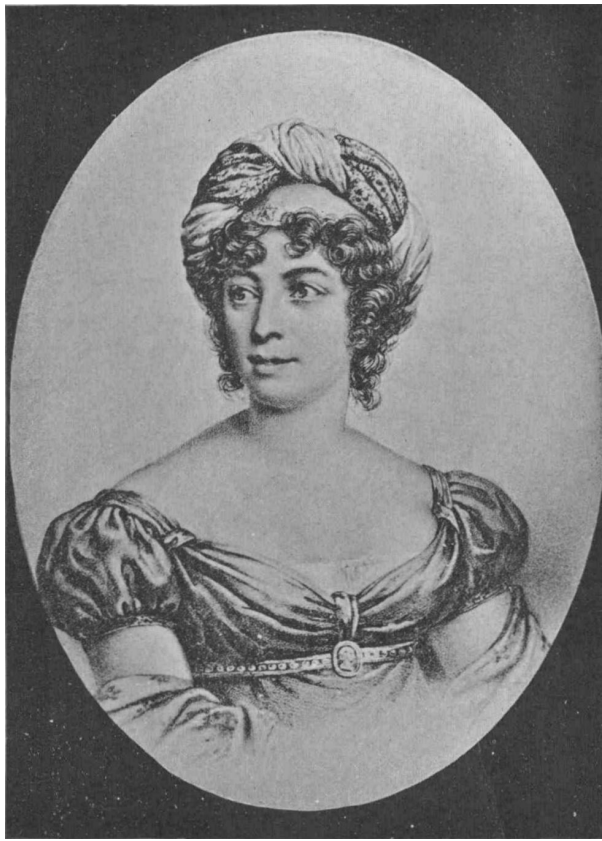
Portrait of Madame de Staël.

Madame de Staël had, therefore, not waited for Napoleon to seek her, but had made the first advances, and sought him.