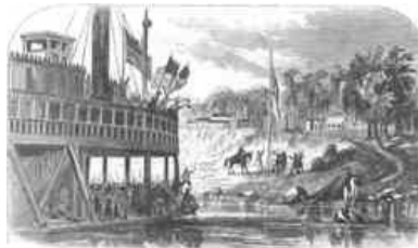
HAULING DOWN A REBEL FLAG AT HICKMAN, KY

Columbus was made very strong by the Rebel engineers, and supplied with many heavy guns for its protection. At the same time, General Prentiss pushed forward the defenses of Cairo, in readiness for any attack by the Rebel gun-boats. For more than half a year Columbus was the northern limit of the Rebel domination of the Great River. On assuming command there, General Polk announced that Columbus was the throat of the Mississippi, and must be held at all hazards. The Rebels repeatedly urged the capture of Cairo, but it was never attempted.