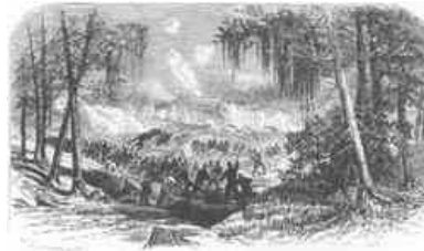
GENERAL BLAIR'S BRIGADE ASSAULTING THE HILL AT CHICKASAW, BAYOU.

At eleven A. M. on the 29th, an assault was made by three brigades of infantry upon the works of the enemy on this portion of the line. General Blair and General Thayer from Steele's Division, pushed forward through an abatis which skirted the edge of the bayou, and captured the first line of Rebel rifle-pits. From this line the brigades pressed two hundred yards farther up the hillside, and temporarily occupied a portion of the second line. Fifty yards beyond was a small clump of trees, which was gained by one regiment, the Thirteenth Illinois, of General Blair's Brigade.