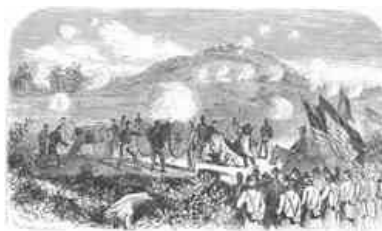
SHELLING THE HILL AT PEA RIDGE.

It was on this road that the two armies took their positions. The lines were in the edge of the woods on opposite sides of the field--the wings of the armies extending to either end. On the northern side were the Rebels, on the southern was the National army. Thus each army, sheltered by the forest, had a cleared space in its front, affording a full view of the enemy.