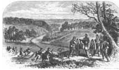
THE OPENING GUN AT BOONEVILLE

The war has made us familiar with horrors. That which once touched us to the heart is now passed over with scarce a moment's thought. Our nerves have been hardened, our sensibilities blunted, our hearts steeled against suffering, in the terrible school through which we have passed.