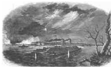
THE CARONDELET RUNNING THE BATTERIES AT ISLAND NO. 10

"I am still pursuing the enemy. The woods are full of stragglers. Some of my officers estimate their number as high as ten thousand. Many have already come into my lines."