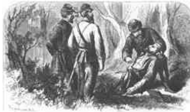
DEATH OF GENERAL LYON

At that battle there was the usual complement of officers for five thousand men. Two years later there were seven major-generals and thirteen brigadier-generals who had risen from the Wilson Creek Army. There were colonels, lieutenant-colonels, and majors, by the score, who fought in the line or in the ranks on that memorable 10th of August. In 1863, thirty-two commissioned officers were in the service from one company of the First Iowa Infantry. Out of one company of the First Missouri Infantry, twenty-eight men received commissions. To the majority of the officers from that army promotion was rapid, though a few cases occurred in which the services they rendered were tardily acknowledged.