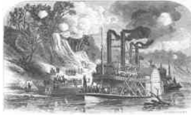
NELSON CROSSING THE TENNESSEE RIVER.

General Nelson reported to General Grant with his division, received his orders, and then dashed about the field, wherever his presence was needed. The division was only slightly engaged before night came on and suspended the battle.