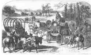
GENERAL SIGEL'S TRANSPORTATION IN THE MISSOURI CAMPAIGN.

A portion of General Fremont's army marched from Jefferson City to Tipton and Syracuse, while the balance, with most of the transportation, was sent by rail. General Sigel was the first to receive orders to march his division from Tipton to Warsaw, and he was very prompt to obey. While other division commanders were waiting for their transportation to arrive from St. Louis, Sigel scoured the country and gathered up every thing with wheels. His train was the most motley collection of vehicles it has ever been my lot to witness. There were old wagons that made the journey from Tennessee to Missouri thirty years before, farm wagons and carts of every description, family carriages, spring wagons, stage-coaches, drays, and hay-carts. In fact, every thing that could carry a load was taken along. Even pack-saddles were not neglected. Horses, mules, jacks, oxen, and sometimes cows, formed the motive power. To stand by the roadside and witness the passage of General Sigel's train, was equal to a visit to Barnum's Museum, and proved an unfailing source of mirth.