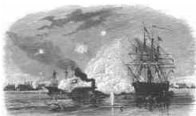
THE REBEL RAM ARKANSAS RUNNING THROUGH OUR FLEET.