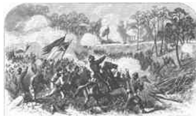
THE REBEL CHARGE AT CORINTH.

The key to our position was on the western side, where two earth-works had been thrown up to command the approaches in that direction. These works were known as "Battery Williams" and "Battery Robbinette," so named in honor of the officers who superintended their erection and commanded their garrisons at the time of the assault. These works were on the summits of two small hills, where the ascent from the main road that skirted their base was very gentle. The timber on these slopes had been cut away to afford full sweep to our guns. An advancing force would be completely under our fire during the whole time of its ascent. Whether succeeding or failing, it must lose heavily.