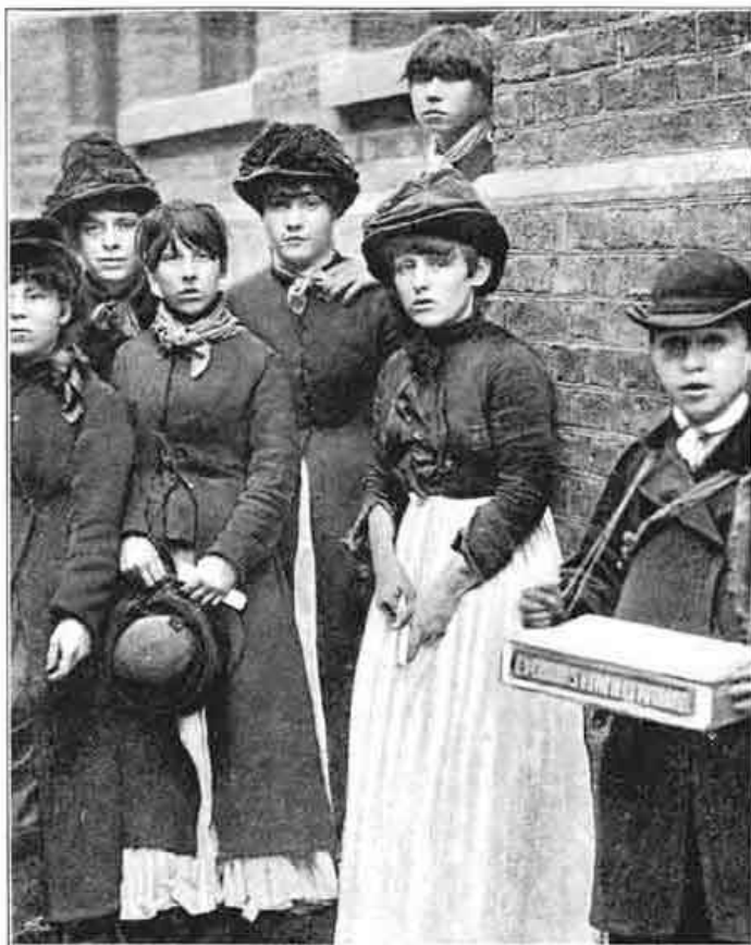
MEMBERS OF THE MATCHMAKERS' UNION.

Thus was ushered in 1889, the to me never-to-be-forgotten year in which I found my way "Home," and had the priceless good fortune of meeting, and of becoming the pupil of, H.P. Blavatsky. Ever more and more had been growing on me the feeling that something more than I had was needed for the cure of social ills. The Socialist position sufficed on the economic side, but where to gain the inspiration, the motive, which should lead to the realisation of the Brotherhood of Man? Our efforts to really organise bands of unselfish workers had failed. Much indeed had been done, but there was not a real movement of self-sacrificing devotion, in which men worked for Love's sake only, and asked but to give, not to take. Where was the material for the nobler Social Order, where the hewn stones for the building of the Temple of Man? A great despair would oppress me as I sought for such a movement and found it not.