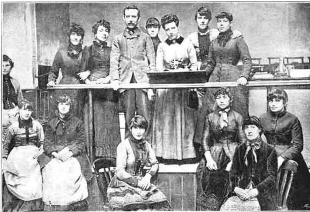
STRIKE COMMITTEE OF THE MATCHMAKERS' UNION.

The worst suffering of all was among the box-makers, thrown out of work by the strike, and they were hard to reach. Twopence-farthing per gross of boxes, and buy your own string and paste, is not wealth, but when the work went more rapid starvation came. Oh, those trudges through the lanes and alleys round Bethnal Green Junction late at night, when our day's work was over; children lying about on shavings, rags, anything; famine looking out of baby faces, out of women's eyes, out of the tremulous hands of men. Heart grew sick and eyes dim, and ever louder sounded the question, "Where is the cure for sorrow, what the way of rescue for the world?"