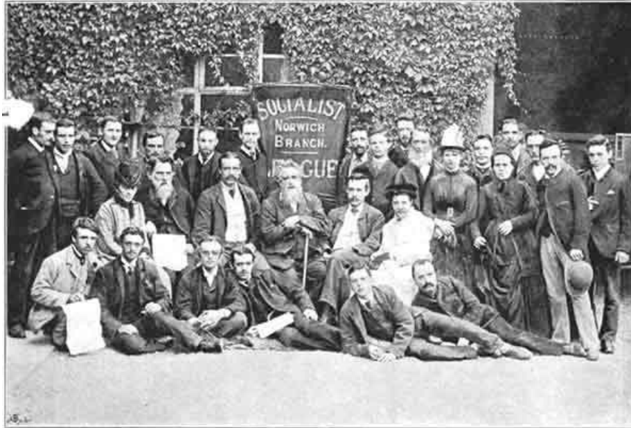
NORWICH BRANCH OF THE SOCIALIST LEAGUE.

thus putting an end to the long struggle, for he took the oath and his seat in the following January, and at once gave notice of an Oaths Bill, to give to all who claimed it, under all circumstances, the right to affirm. He was returned with the largest vote ever polled for him—4,315—and he entered Parliament with all the prestige of his great struggle, and went to the front at once, one of the recognised forces in the House. The action of Mr. Speaker Peel promptly put an end to an attempted obstruction. Sir Michael Hicks Beach, Mr. Cecil Raikes, and Sir John Hennaway had written to the Speaker asking his interference, but the Speaker declared that he had no authority, no right to stand between a duly elected member and the duty of taking the oath prescribed by statute. Thus ended the constitutional struggle of six years, that left the victor well-nigh bankrupt in health and in purse, and sent him to a comparatively early grave. He lived long enough to justify his election, to prove his value to the House and to his country, but he did not live long enough to render to England all the services which his long training, his wide knowledge, his courage, and his honesty so eminently fitted him to yield.