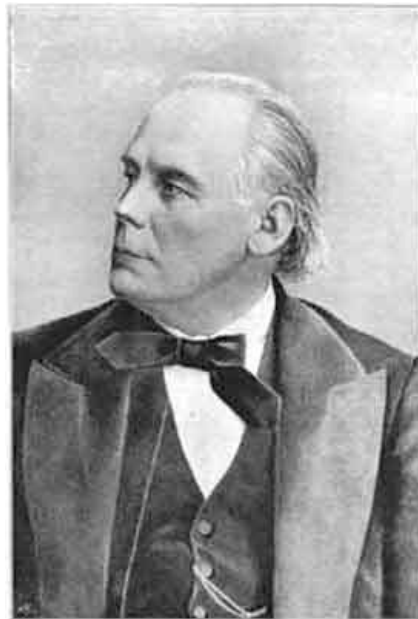
CHARLES BRADLAUGH M.P.

"He is the finest speaker of Saxon-English that I have ever heard," she answered, "except, perhaps, John Bright, and his power over a crowd is something marvellous. Whether you agree with him or not, you should hear him."