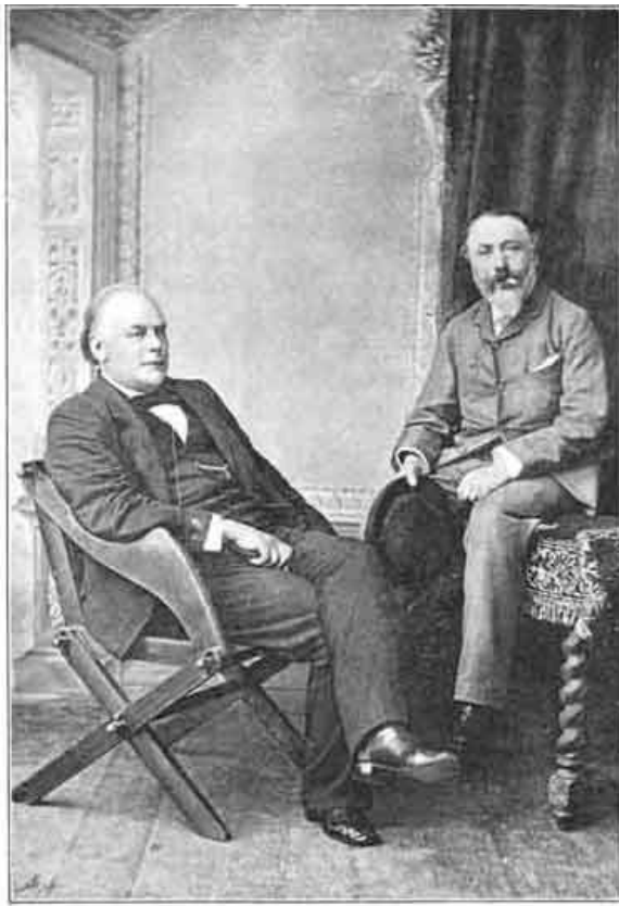
CHARLES BRADLAUGH AND HENRY LABOUCHERE.