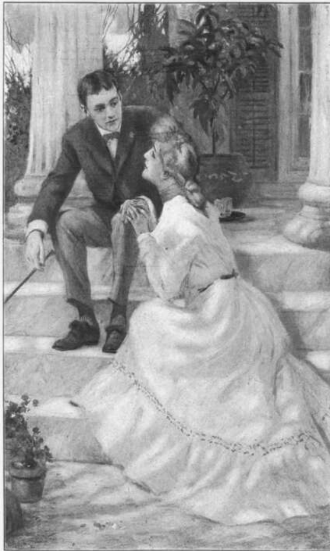
“‘YOU SHALL NOT SAY THAT!’”

He released his hand and drank the rest of his lemonade, and she added, “Have mine, too,” but he shook his head in answering, “I’ve no business to think so, unless I act so, too.”