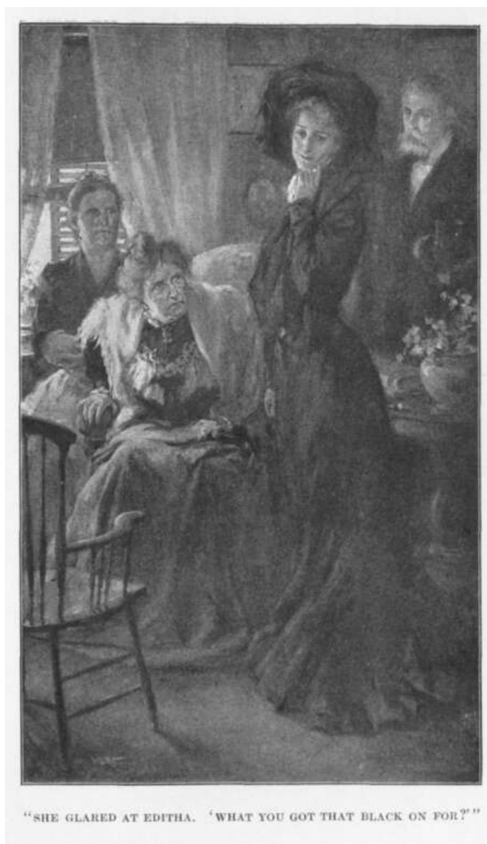
"SHE GLARED AT EDITHA. 'WHAT YOU GOT THAT BLACK ON FOR?'"

"No, you didn't expect him to get killed," Mrs. Gearson repeated, in a voice which was startlingly like George's again. "You just expected him to kill some one else, some of those foreigners, that weren't there because they had any say about it, but because they had to be there, poor wretches—conscripts, or whatever they call 'em. You thought it would be all right for my George, your George, to kill the sons of those miserable mothers and the husbands of those girls that you would never see the faces of." The woman lifted her powerful voice in a psalmlike note. "I thank my God he didn't live to do it! I thank my God they killed him first, and that he ain't livin' with their blood on his hands!" She dropped her eyes, which she had raised with her voice, and glared at Editha. "What you got that black on for?" She lifted herself by her powerful arms so high that her helpless body seemed to hang limp its full length. "Take it off, take it off, before I tear it from your back!"