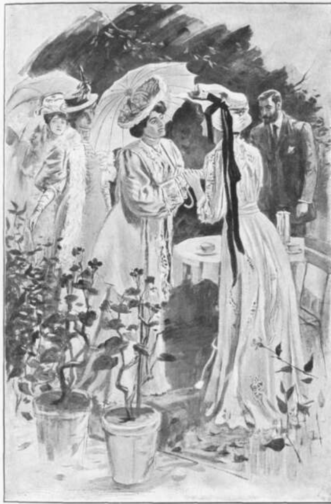
A LIVELY MATRON, OF AS YOUTHFUL A TEMPERAMENT AS THE LIVELY GIRLS SHE BROUGHT IN HER TRAIN, BURST UPON THEM

"That is what papa thinks," Miss Gerald said, and while she sat dreamily absent, a rustle of skirts and a flutter of voices pierced from the surrounding shrubbery, and then a lively matron, of as youthful a temperament as the lively girls she brought in her train, burst upon them, and Miss Gerald was passed from one embrace to another until all four had kissed her. She returned their greeting, and shared, in her quieter way, their raptures at their encounter.