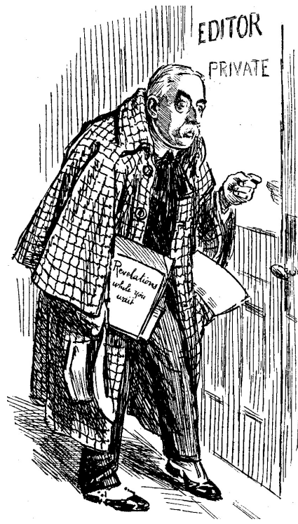
FROM FIELD-MARSHAL TO JOURNALIST. LORD FRENCH'S PROMOTION.

A proposal by Mr. SYDNEY ARNOLD to raise the limit of exemption from income-tax from £130 to £250 was strongly backed by the Labour Party. In resisting it the CHANCELLOR OF THE EXCHEQUER pointed out that the Labour Party had opposed indirect taxation and now they were opposing direct taxation. In what form did they consider that working-men should contribute to the expenses of their country? No answer to this blunt question was forthcoming.