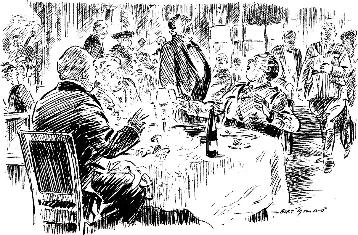
Waiter (a demobilised Sergeant—as Staff officer enters). "ROOM—'SHUN!"

The Commission broke up at a late hour. At the next meeting evidence will be taken on the subject of the housing of musical seals and the alleged profiteering of dealers in burnt cork at the expense of players in Jazz-bands.