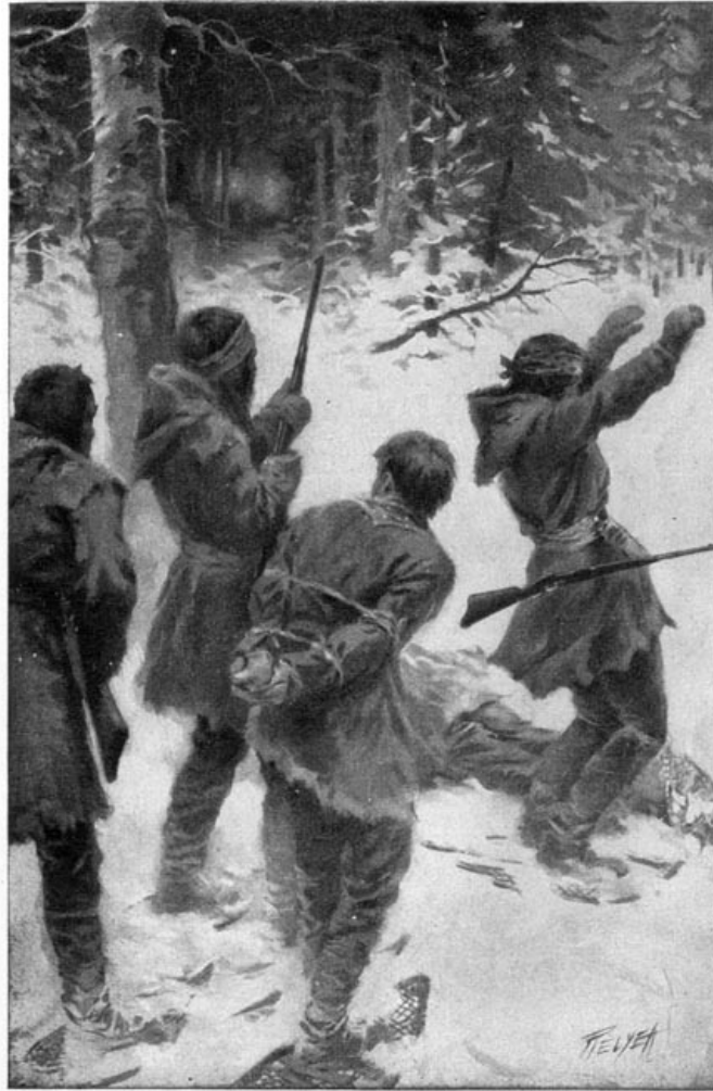
The leader stopped in his snow-shoes Page 274

below them was unfolded to their eyes a scene which, despite his companion's warning, wrung an exclamation of dismay from Roderick's lips.