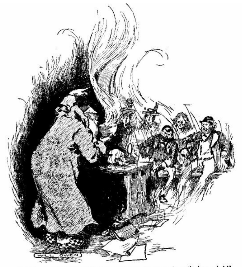
"Ah! what is this? a piece of wreckage with a monkey clinging to it?"

"The ship sinks," continued the astrologer, in thrilling tones. "Ah! what is this? a piece of wreck-age with a monkey clinging to it? No, no-o. The ill-shaped man again. Dear me!"