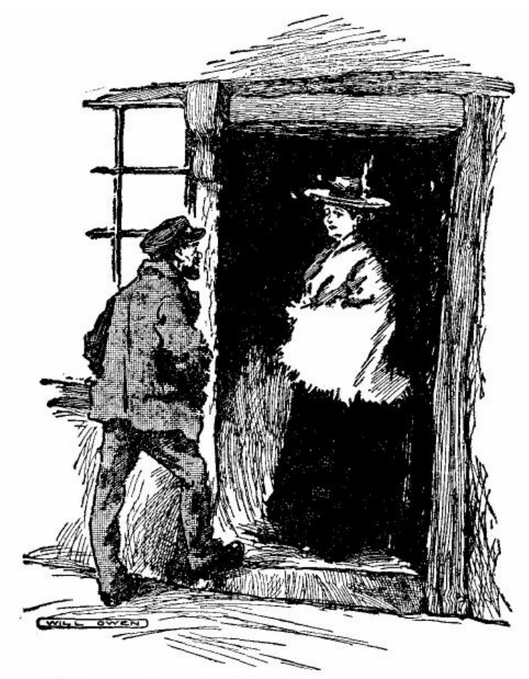
" Have you left anything inside that you want?' she inquired."

Mr. Boxer shook his head. "I only wanted to come in and make a clean breast of it," he said, in a curious voice; "then I'll go."