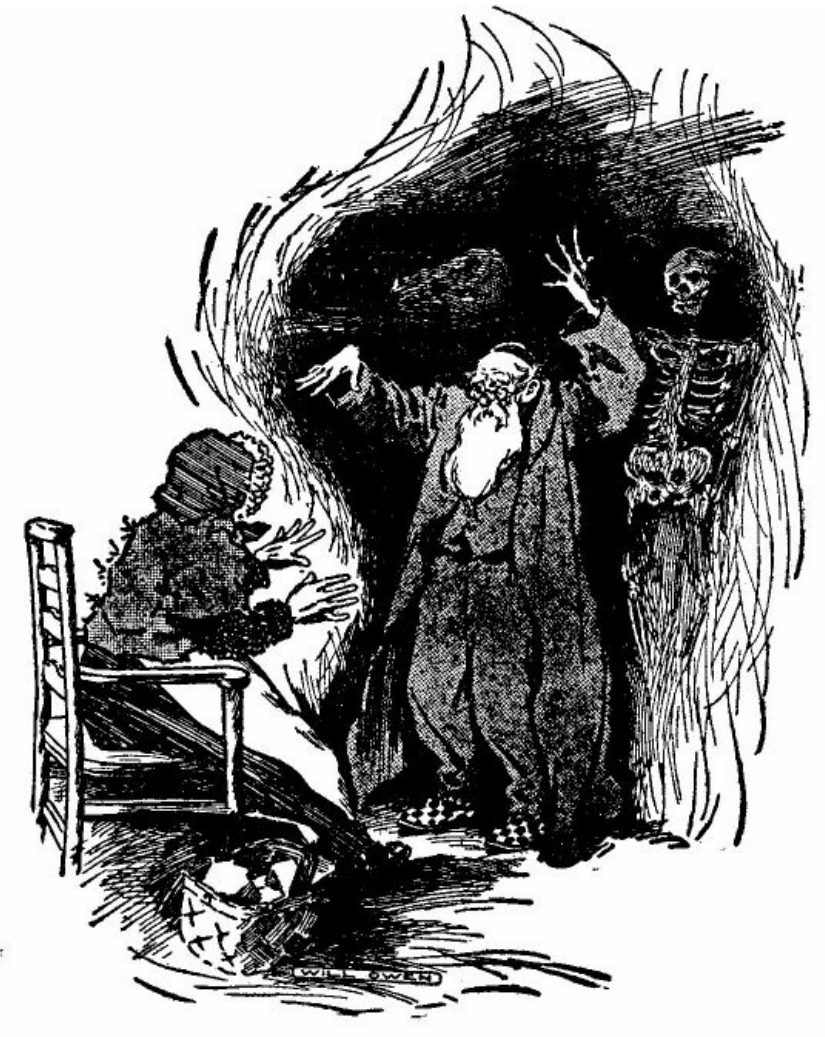
"There is something forming over you."

"There's some danger hanging over you," continued Mr. Silver, in a low, thrilling voice; "some danger in connection with your son-in-law. There" he waved a lean, shrivelled hand backward and for-ward as though dispelling a fog, and peered into distance—"there is something forming over you. You—or somebody—are hiding something from me."