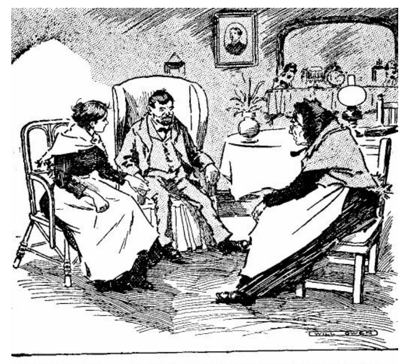
"Well, look 'ere,' said Mr. Boxer, 'I've told you my story and I've got witnesses to prove it.'"

"We'll go round after we've shut up, mother," said Mrs. Boxer. "We'll have a bit o' supper first and then start early."