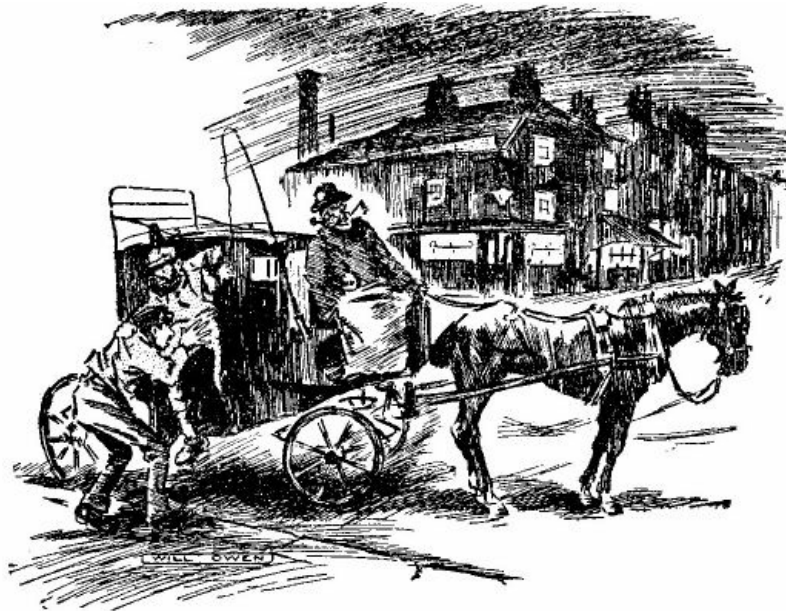
“ Bill jumped into a cab and pulled Peter Russet in arter 'im.”

swallow the whistle, jumped into a cab and pulled Peter Russet in arter 'im.