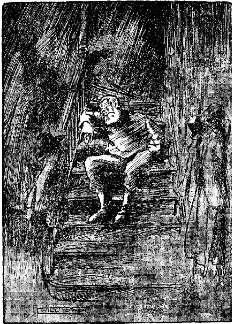
“ 'e picked out the softest stair 'e could find.”

It was about six o'clock when 'e woke up, and broad daylight. He was stiff and sore all over, and feeling braver in the light 'e stepped softly upstairs and opened the door. Peter and Ginger was waiting for 'im, and as he peeped in 'e saw two things sitting up in bed with their 'air standing up all over like mops and their faces tied up with bandages. He was that startled 'e nearly screamed, and then 'e stepped into the room and stared at 'em as if he couldn't believe 'is eyes.