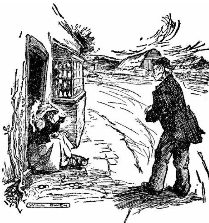
“ Mrs. Prince was sitting at 'er front door nursing 'er three cats.”

He sat up late that night thinking it over, and, arter looking at it all ways, he made up 'is mind to go and see Mrs. Prince, an old lady that lived all alone by 'erself in a cottage near Smith's farm. He'd set 'er down for wot he called a white witch, which is the best kind and on'y do useful things, such as charming warts away or telling gals about their future 'usbands; and the next arternoon, arter telling 'is wife's mother that fresh air and travelling was the best cure for the yellow jaundice, he set off to see 'er.