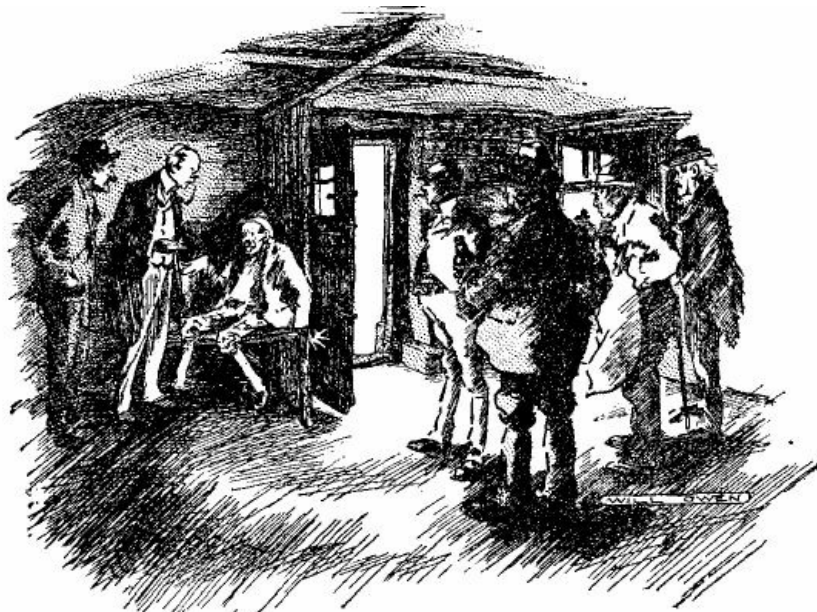
“ The doctor felt 'is pulse and looked at 'is tongue.”

The doctor pushed 'em out of the way in a moment, and then 'e bent over Bill and felt 'is pulse and looked at 'is tongue. Then he listened to his 'art, and in a puzzled way smelt at the bottle, which Jasper Potts was a-minding of, and wetted 'is finger and tasted it.